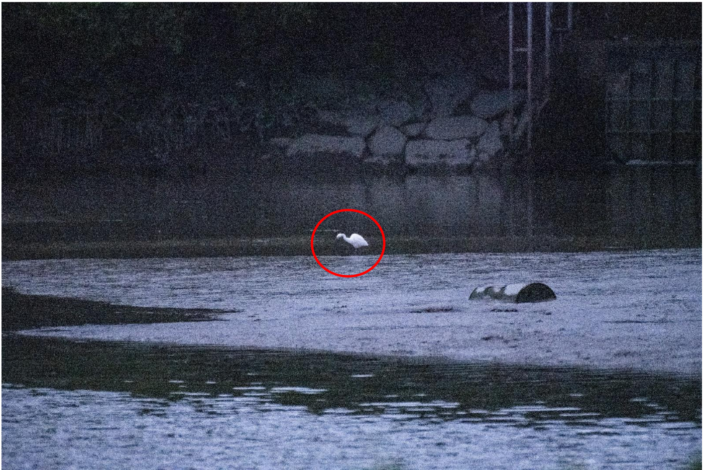
Appendix O.2.1a: Pre-roost aggregate of Little Egret Chinese Pond Heron Egretta garzetta in the mudflat area east of the Project boundary observed on 17 October 2023 around 18:12