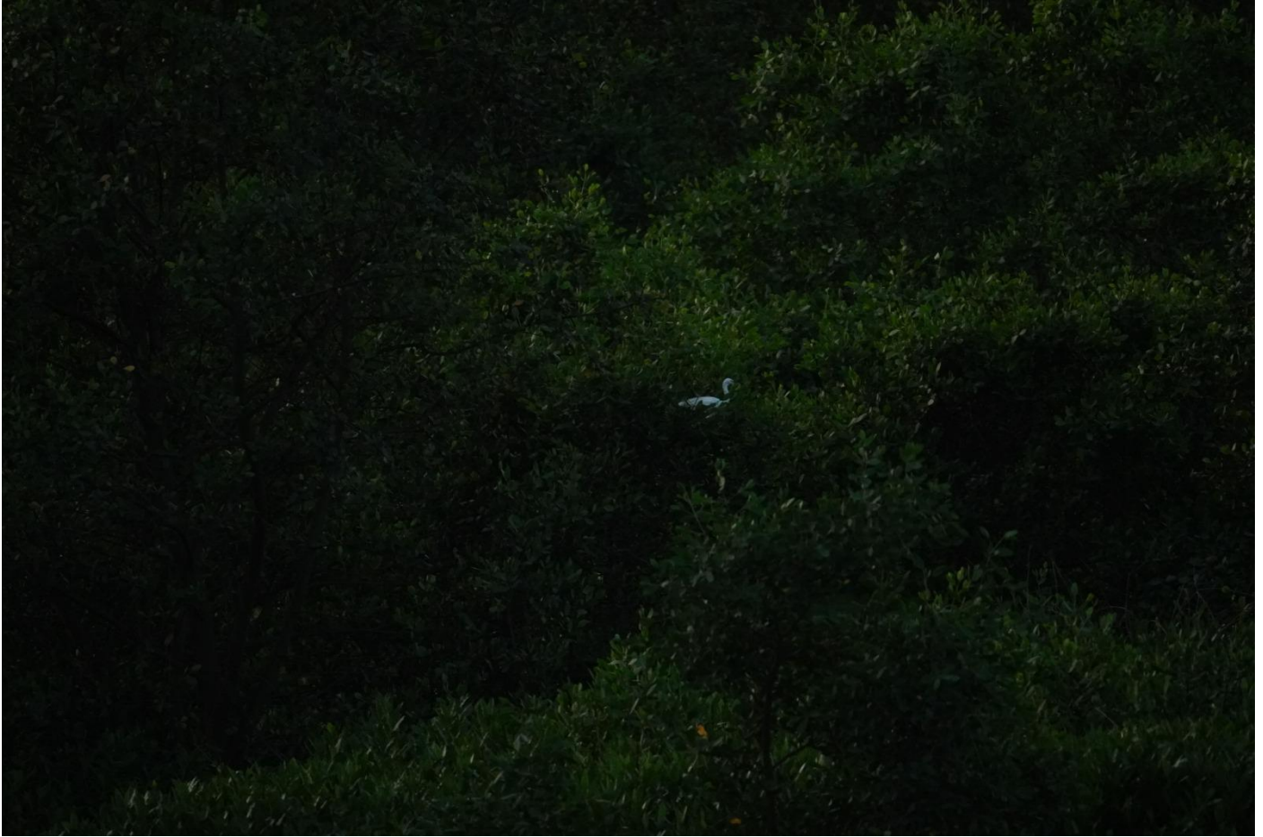
Appendix O.2.2a: Active night roost on Sonneratia apetala and S. caseolaris mangrove roosting substrate located northeast of the Project boundary observed on 17 October 2023 around 18:30.