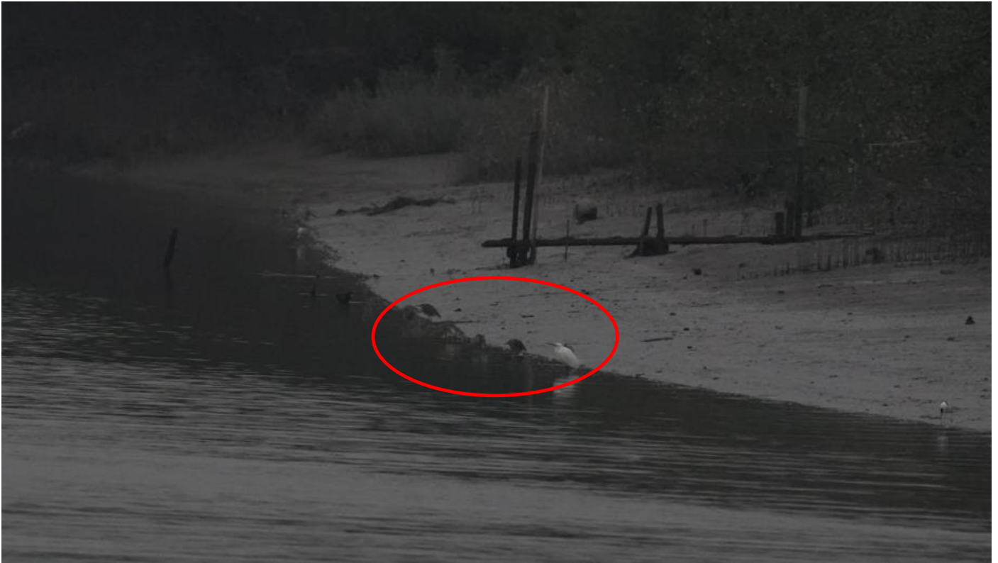
Appendix O.2.1a: Pre-roost aggregate of Chinese Pond Heron Ardeola bacchus and Little Egret Egretta garzetta in the mudflat northeast side of the Project boundary observed on 28 February 2024 around 17:50