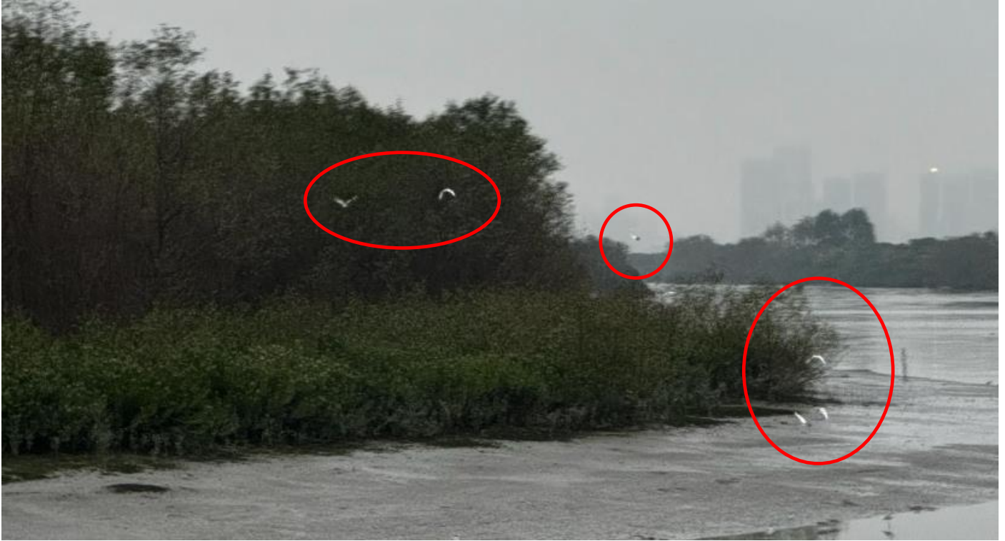
Appendix O.2.2a: Active night roost on Sonneratia apetala and S. caseolaris mangrove roosting substrate in the mudflat northeast side of the Project boundary observed on 28 February 2024 around 18:26.