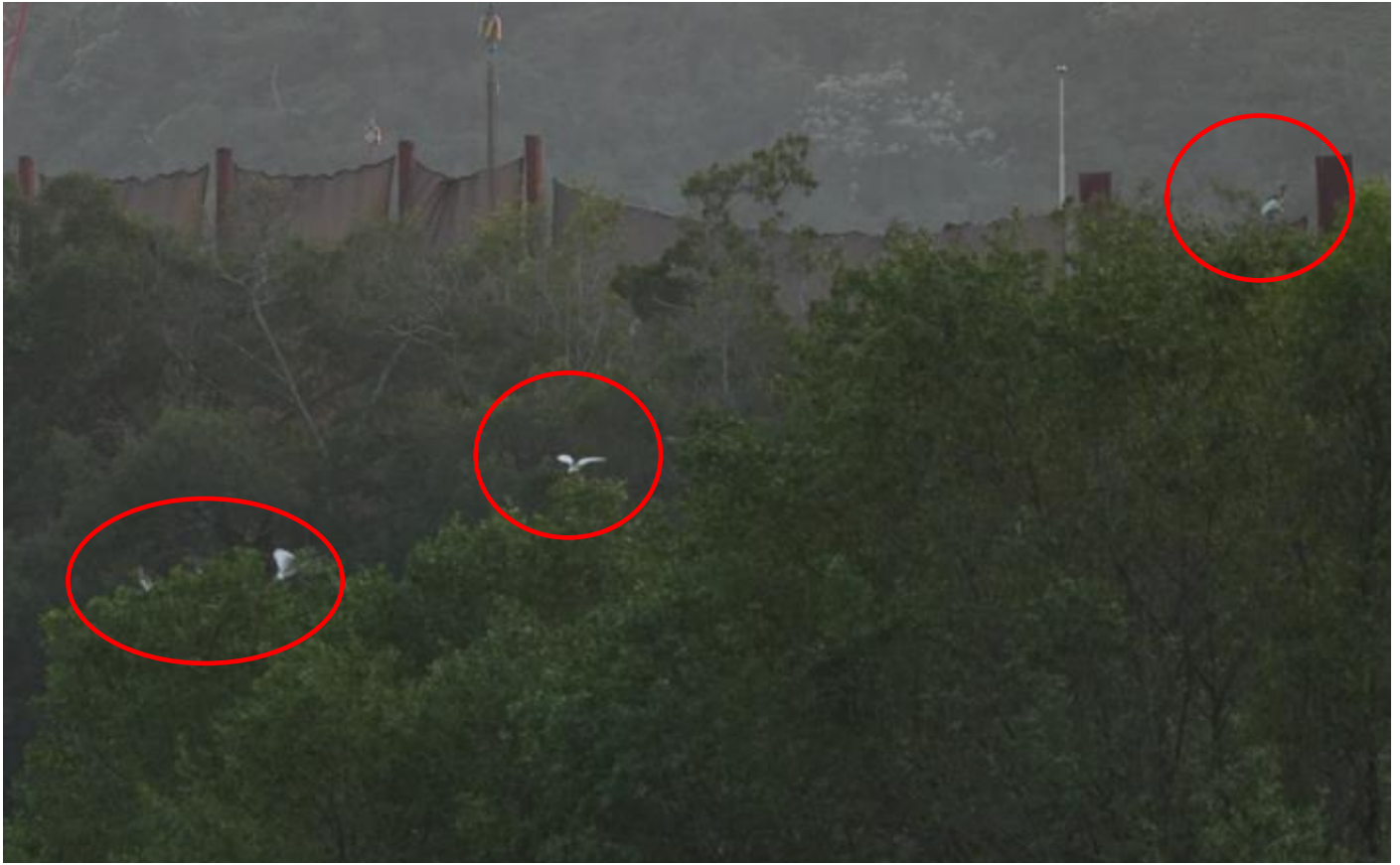
Appendix O.2.1a: Pre-roost aggregate of Chinese Pond Heron Ardeola bacchus in the mudflat east side of the Project boundary observed on 25 March 2024 around 18:09