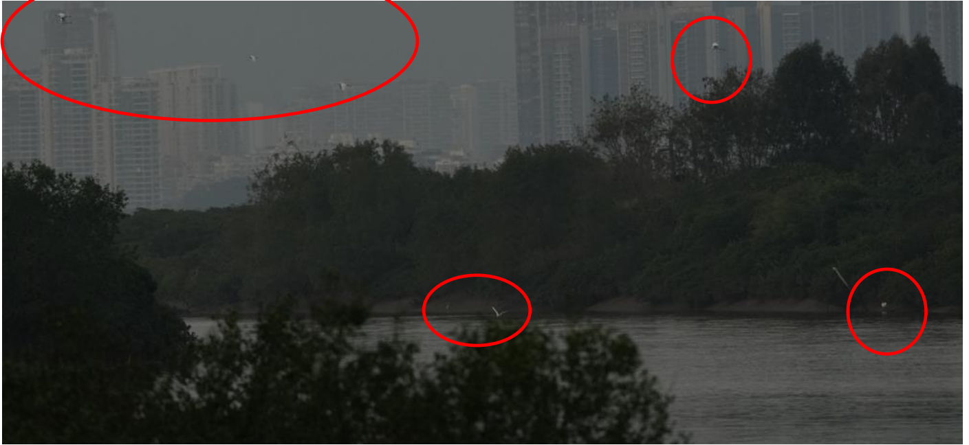
Appendix O.2.2a: Active night roost on Sonneratia apetala and S. caseolaris mangrove roosting substrate in the mudflat northeast side of the Project boundary observed on 25 March 2024 around 18:23.