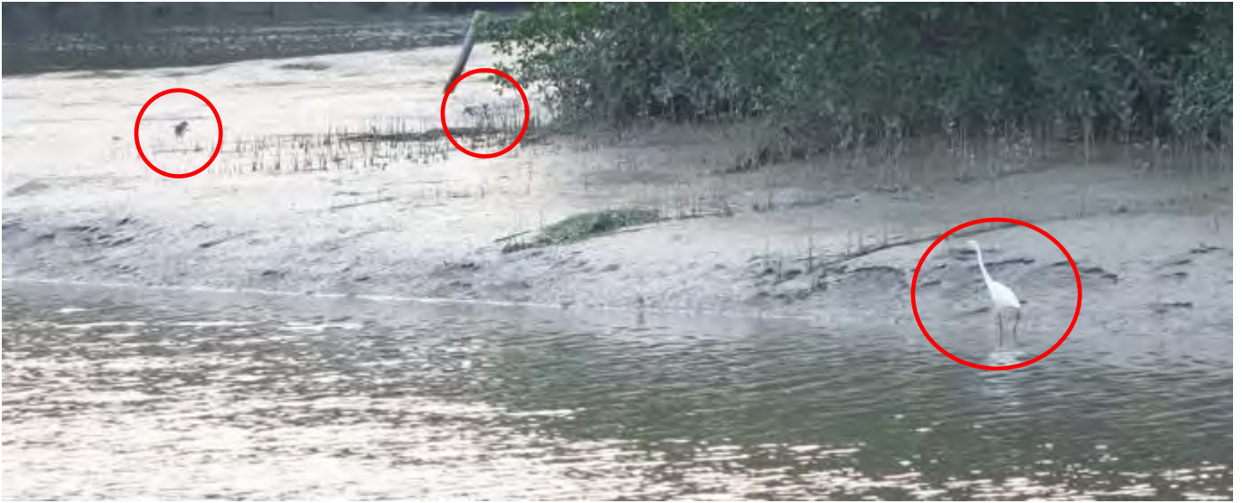
Appendix O.2.1a: Pre-roost aggregate of Chinese Pond Heron Ardeola bacchus in the mudflat east side of the Project boundary observed on 12 April 2024 around 18:24