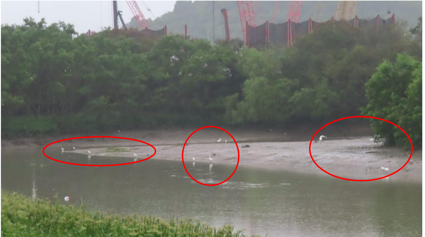
Appendix O.2.1a: Pre-roost aggregate of ardeids in the mudflat east side of the Project boundary observed on 23 May 2024 at around 18:10