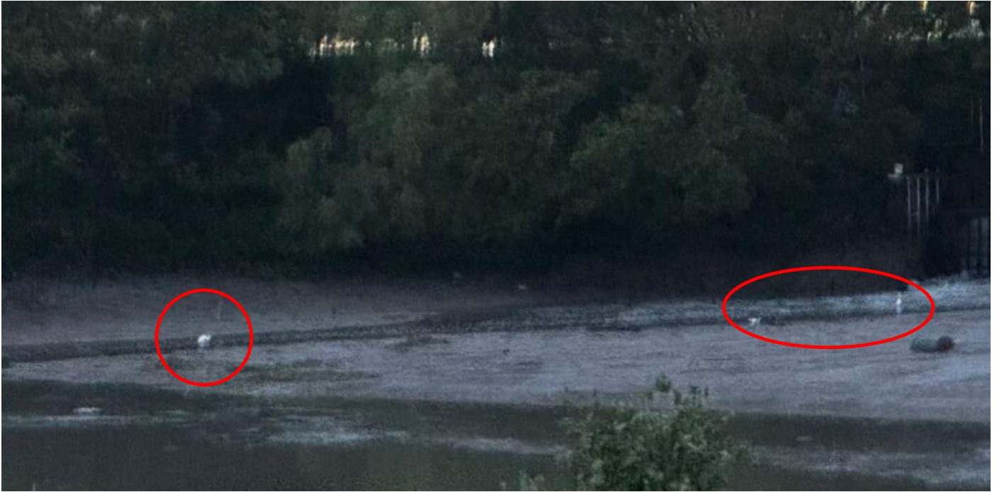
Appendix O.2.2a: Active night roost in the mudflat east side of the Project boundary observed on 23 May 2024 at around 19:07.