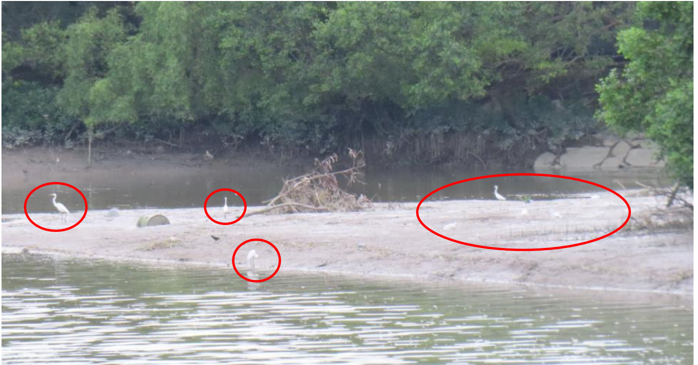
Appendix O.2.1a: Pre-roost aggregate of ardeids in the mudflat east side of the Project boundary observed on 19 June 2024 at around 18:09.