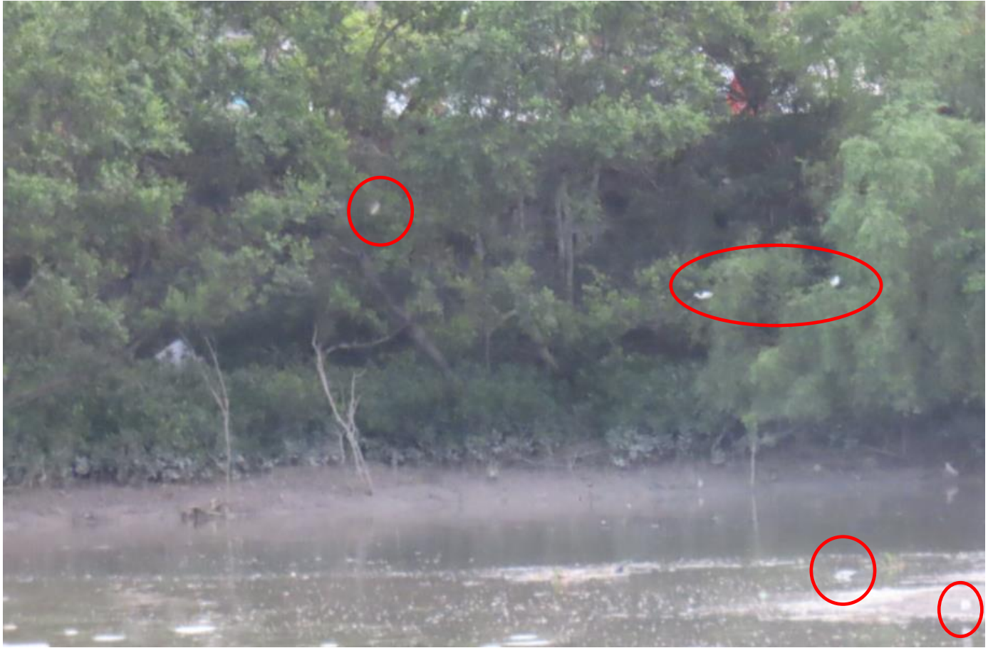
Appendix O.2.2a: Active night roost in the mudflat east side of the Project boundary observed on 19 June 2024 at around 18:58.