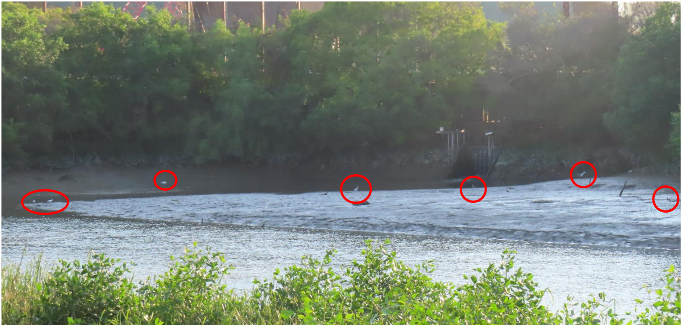
Appendix O.2.1a: Pre-roost aggregate of ardeids in the mudflat east side of the Project boundary observed on 9 July 2024 at around 18:24.