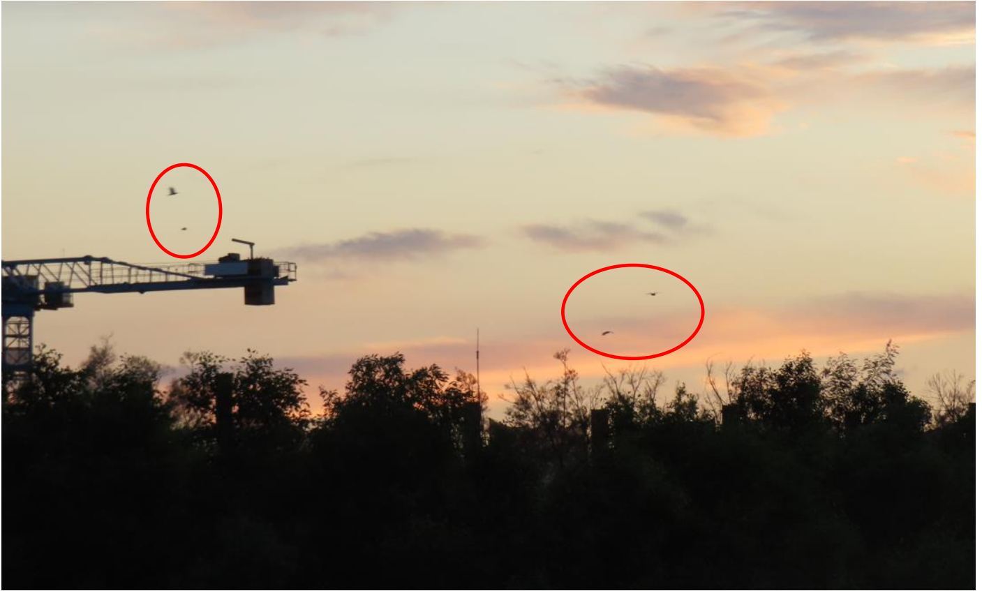
Appendix O.2.2a: Active night roost in the mudflat east side of the Project boundary observed on 9 July 2024 at around 19:14.