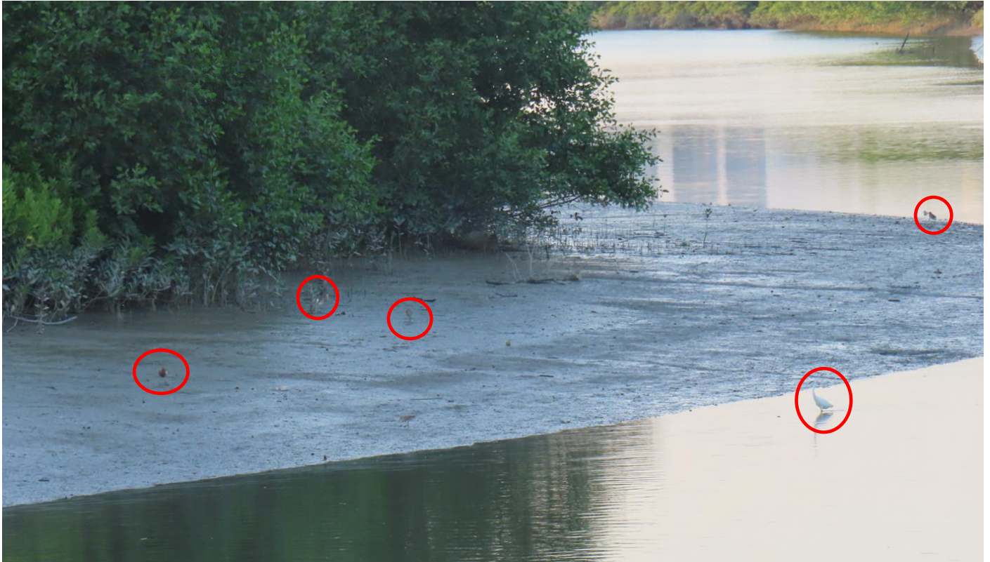
Appendix O.2.1a: Pre-roost aggregate of ardeids in the mudflat northeast side ANR2 of the Project boundary observed on 9 August 2024 at around 18:34.