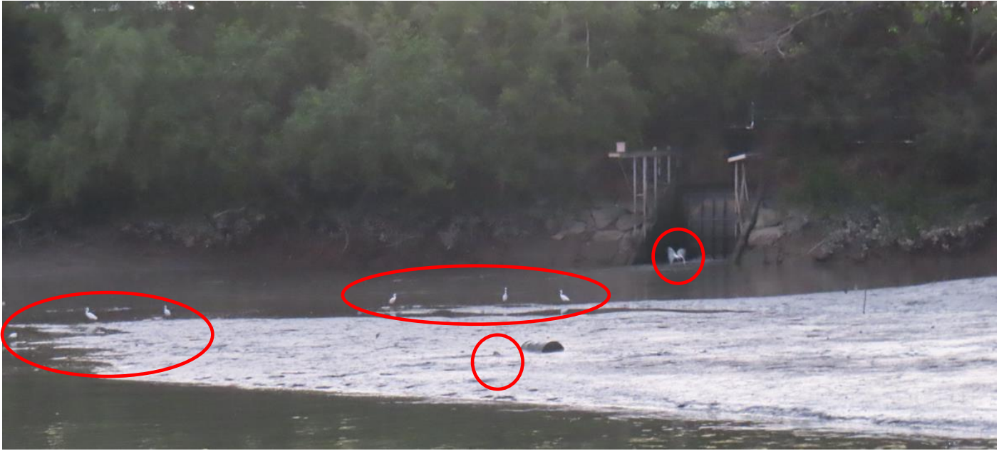
Appendix O.2.2a: Active night roost in the mudflat east side of the Project boundary observed on 9 August 2024 at around 19:09.