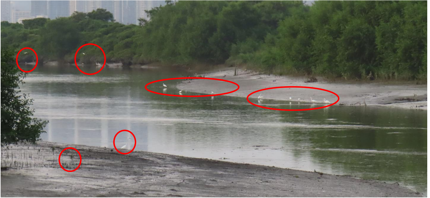
Appendix O.2.2a: Active night roost (ANR2) in the mudflat northeast side of the Project boundary observed on 30 September 2024 at around 18:17.