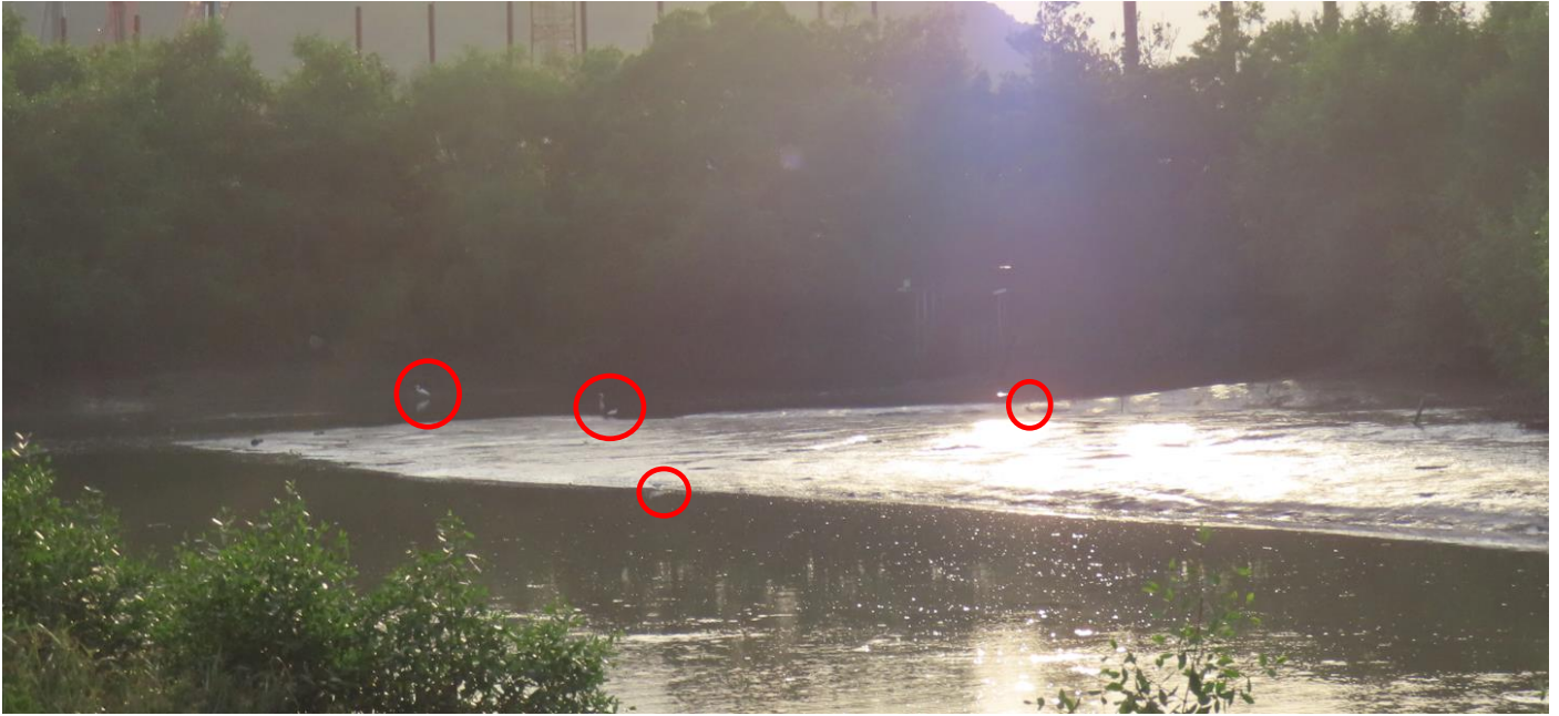
Appendix O.2.1a: Pre-roost aggregate of ardeids in the mudflat east side of the Project boundary (ANR1) observed on 30 September 2024 at around 17:15.