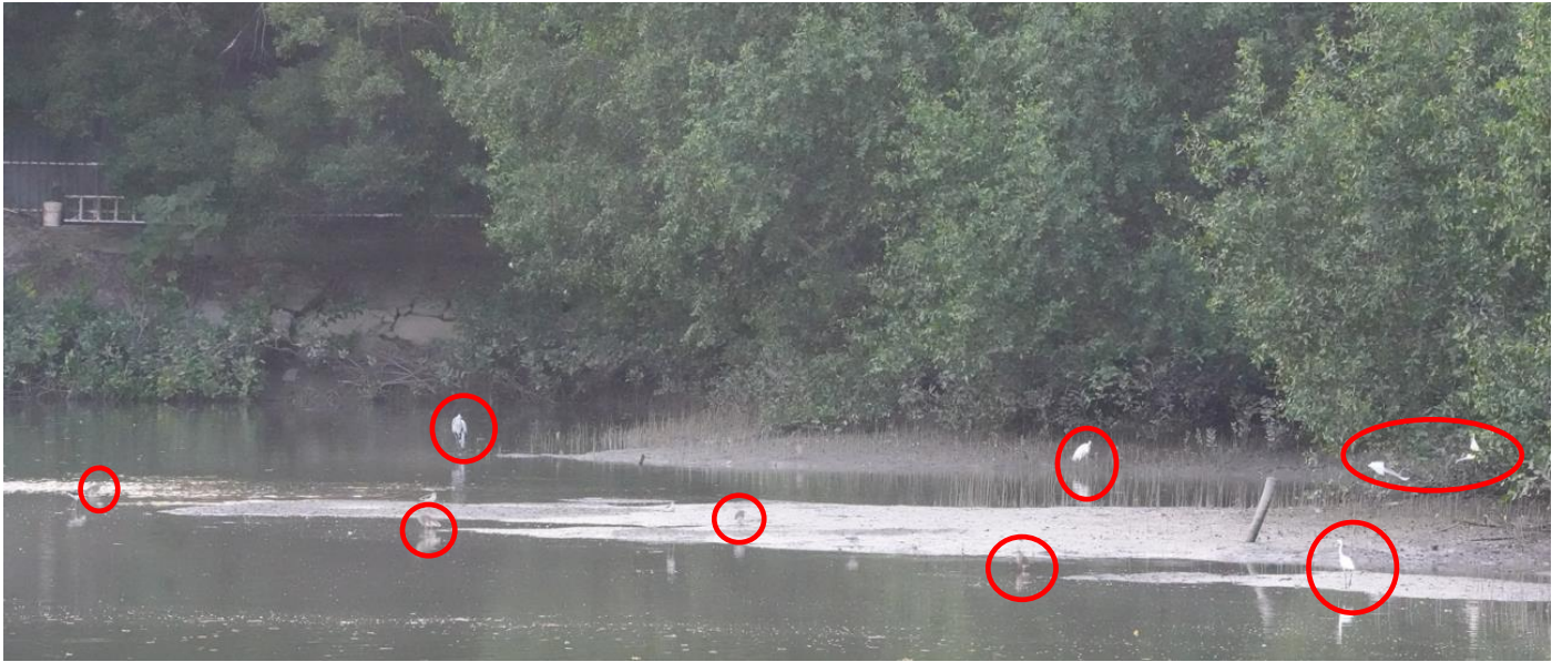
Appendix O.2.1a: Pre-roost aggregate of ardeids in the mudflat east side of the Project boundary (ANR1) observed on 30 October 2024 at around 17:24.