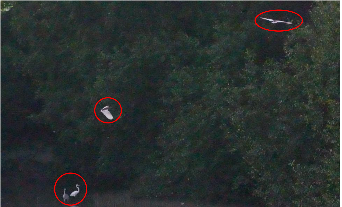
Appendix O.2.2a: Active night roost in the mudflat east side of the Project boundary (ANR1) observed on 30 October 2024 at around 17:52.