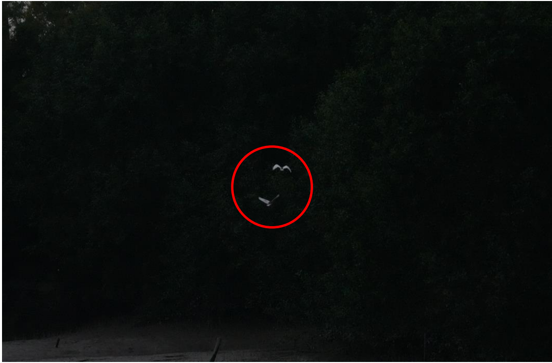
Appendix O.2.2a: Active night roost in the mudflat east side of the Project boundary (ANR1) observed on 4 November 2024 at around 17:41.