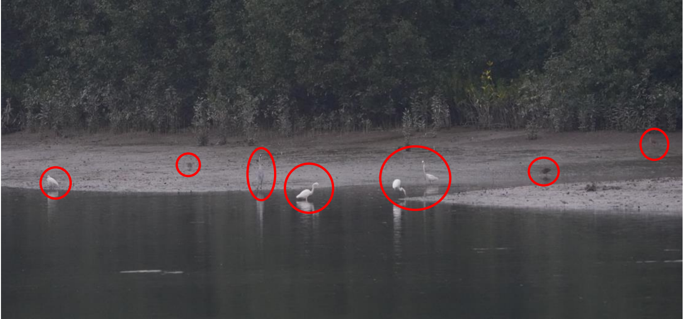
Appendix O.2.1a: Pre-roost aggregate of ardeids in the mudflat northeast side of the Project boundary (ANR2) observed on 4 November 2024 at around 17:23.