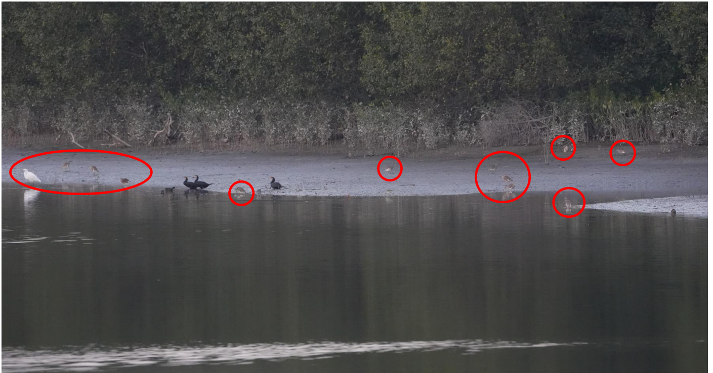
Appendix O.2.1a: Pre-roost aggregate of ardeids in the mudflat northeast side of the Project boundary (ANR2) observed on 18 December 2024 at around 17:28.