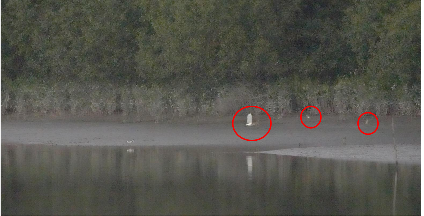
Appendix O.2.2a: Active night roost in the mudflat northeast side of the Project boundary (ANR2) observed on 18 December 2024 at around 17:45.