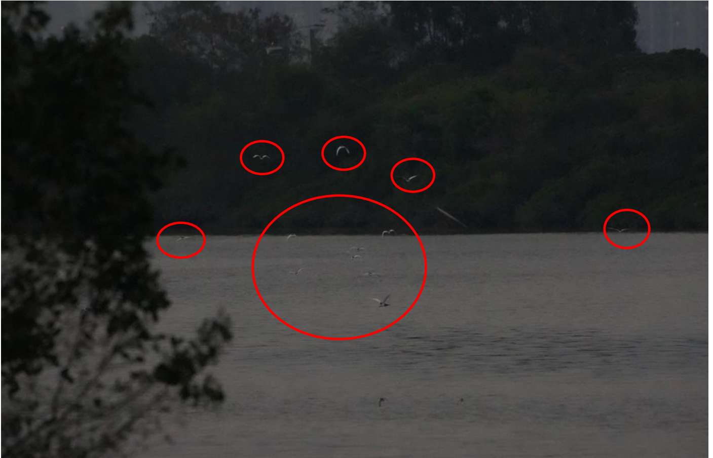
Appendix O.2.2a: Active night roost in the mudflat northeast side of the Project boundary (ANR2) observed on 15 January 2025 at around 17:59.