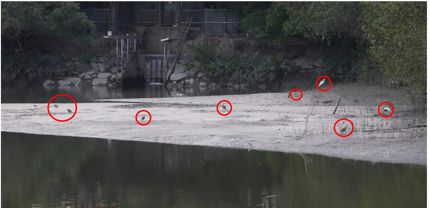
Appendix O.2.1a: Pre-roost aggregate of ardeids in the mudflat east side of the Project boundary (ANR1) observed on 15 January 2025 at around 17:31.