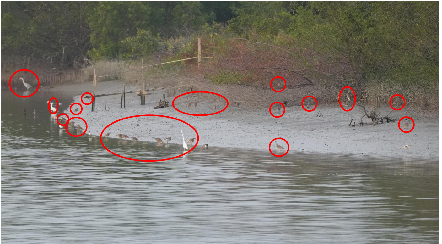
Appendix O.2.1a: Pre-roost aggregate of ardeids in the mudflat northeast side of the Project boundary (ANR2) observed on 17 February 2025 at around 17:55