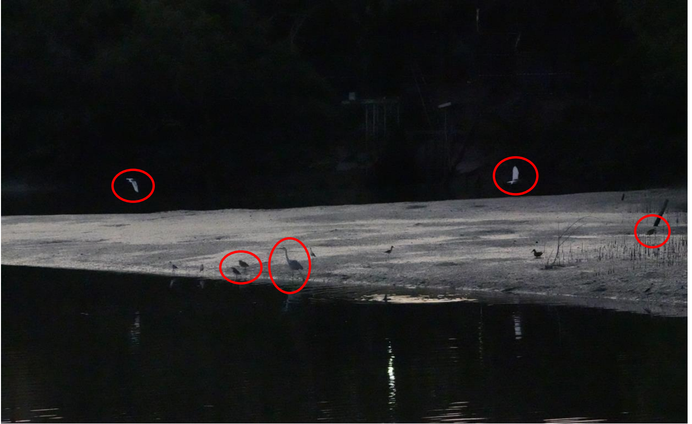
Appendix O.2.2a: Active night roost in the mudflat east side of the Project boundary (ANR1) observed on 17 February 2025 at around 18:25.