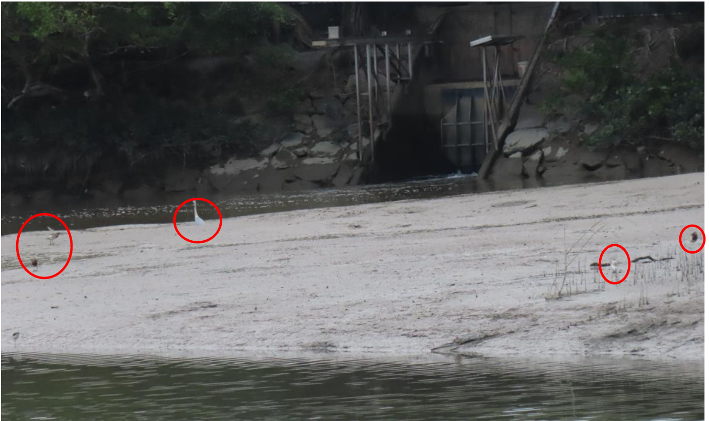
Appendix O.2.1a: Pre-roost aggregate of ardeids in the mudflat east side of the Project boundary (ANR1) observed on 18 March 2025 at around 18:01.