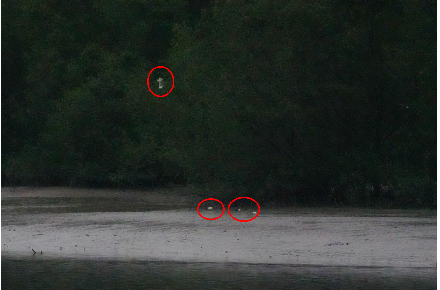
Appendix O.2.2a: Active night roost in the mudflat northeast side of the Project boundary (ANR2) observed on 18 March 2025 at around 18:34.