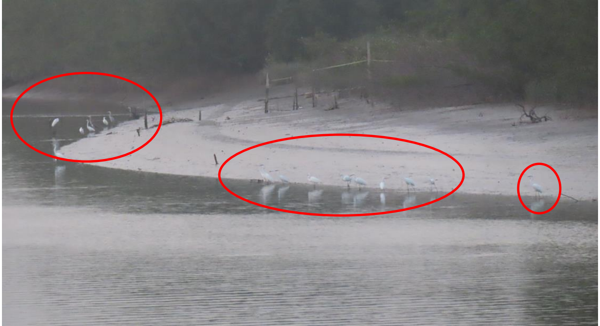
Appendix O.2.1a: Pre-roost aggregate of ardeids in the mudflat northeast side of the Project boundary (ANR2) observed on 14 April 2025 at around 18:22.