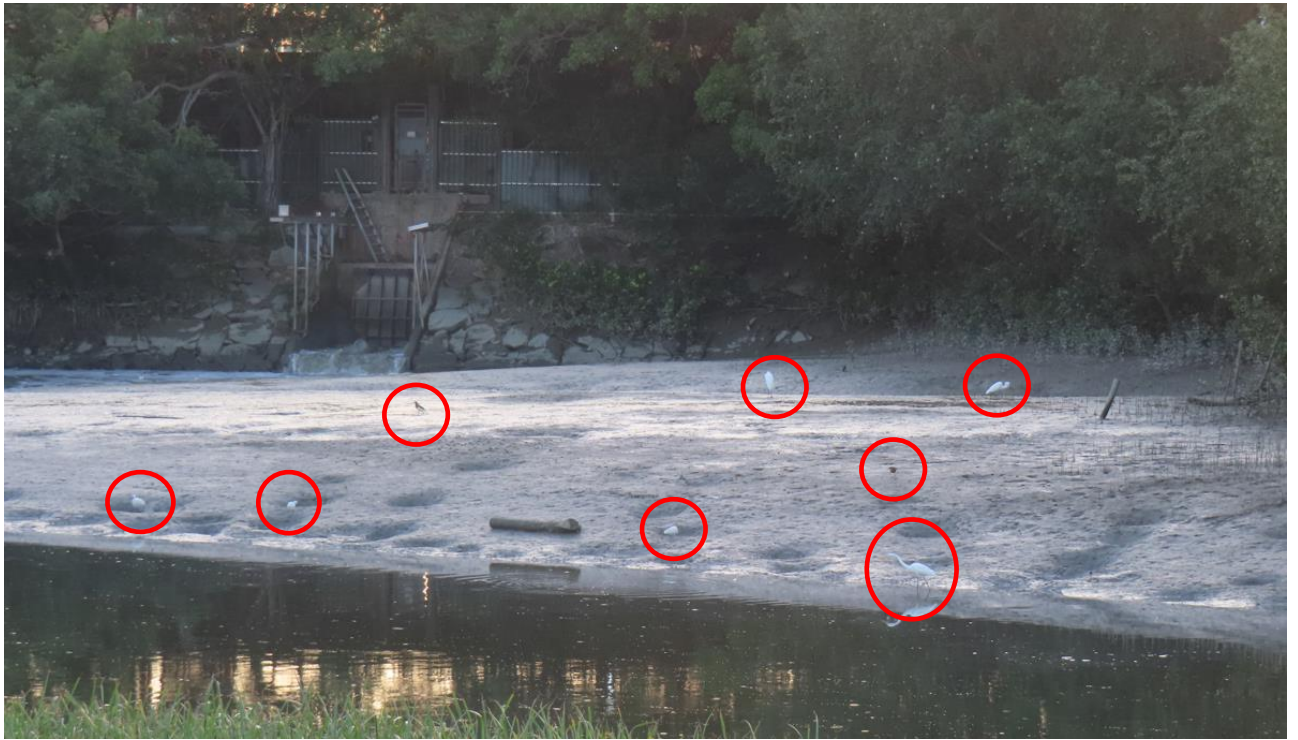
Appendix O.2.1a: Pre-roost aggregate of ardeids in the mudflat east side of the Project boundary (ANR1) observed on 12 May 2025 at around 18:30.