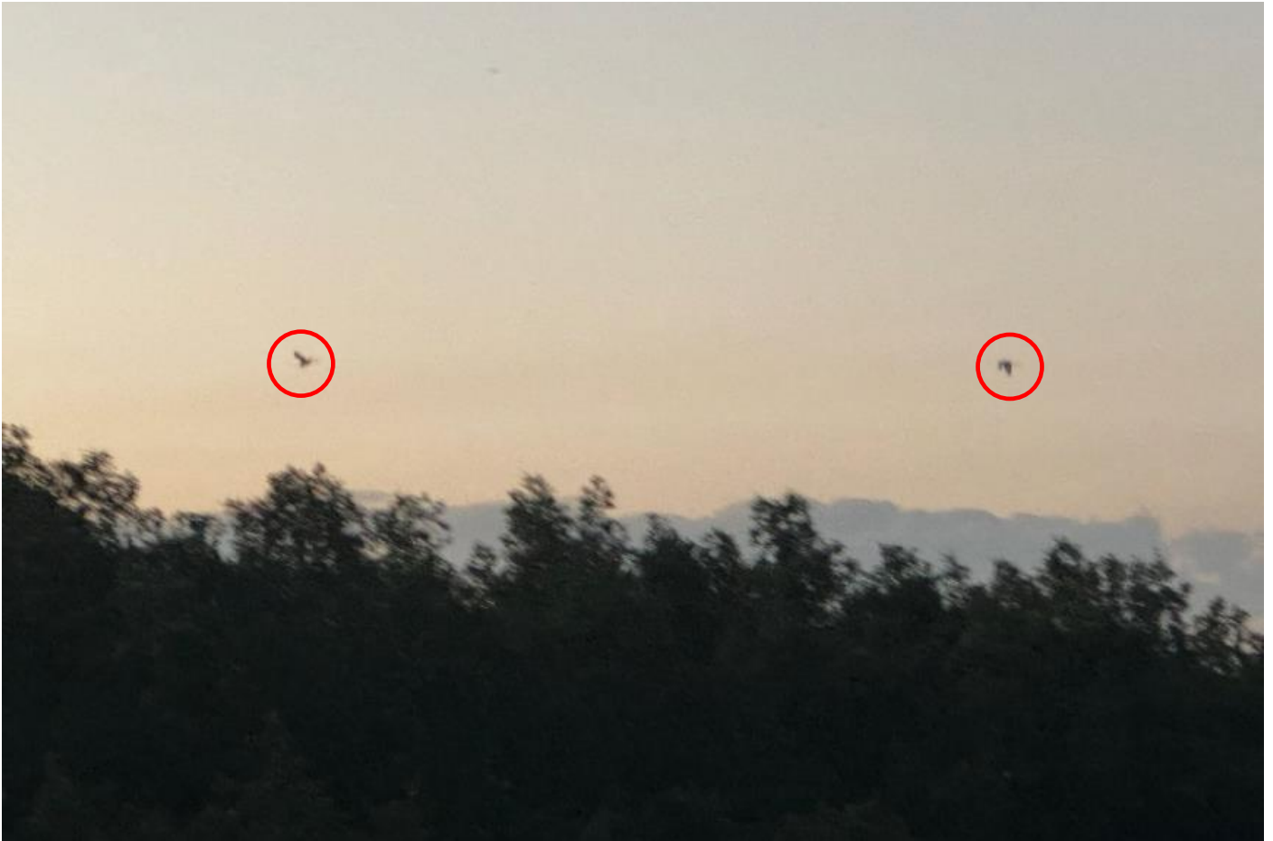
Appendix O.2.2a: Active night roost in the mudflat east side of the Project boundary (ANR1) observed on 12 May 2025 at around 19:13.