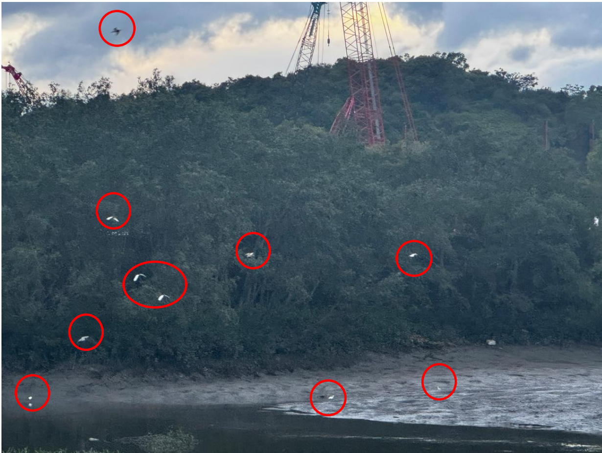
Appendix O.2.2a: Active night roost in the mudflat east side of the Project boundary (ANR1) observed on 11 June 2025 at around 18:57.