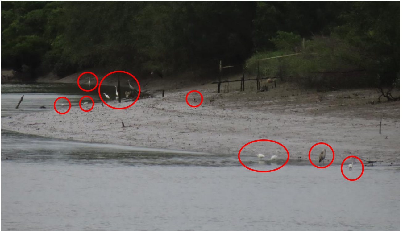
Appendix O.2.1a: Pre-roost aggregate of ardeids in the mudflat northeast side of the Project boundary (ANR2) observed on 11 June 2025 at around 18:37.