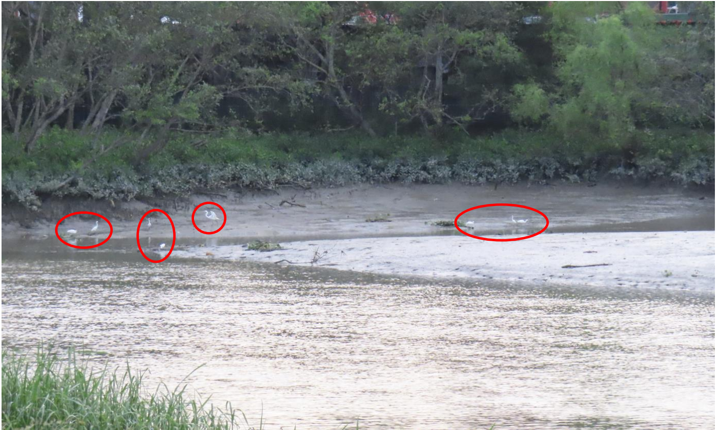
Appendix O.2.1a: Pre-roost aggregate of ardeids in the mudflat east side of the Project boundary (ANR1) observed on 14 July 2025 at around 18:32.