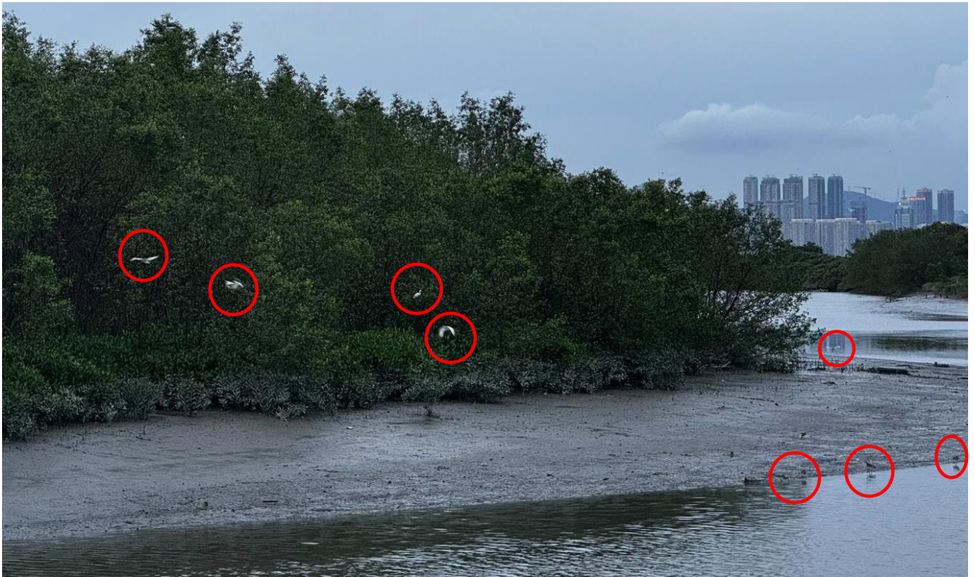
Appendix O.2.2a: Active night roost in the mudflat northeast side of the Project boundary (ANR2) observed on 14 July 2025 at around 19:14.