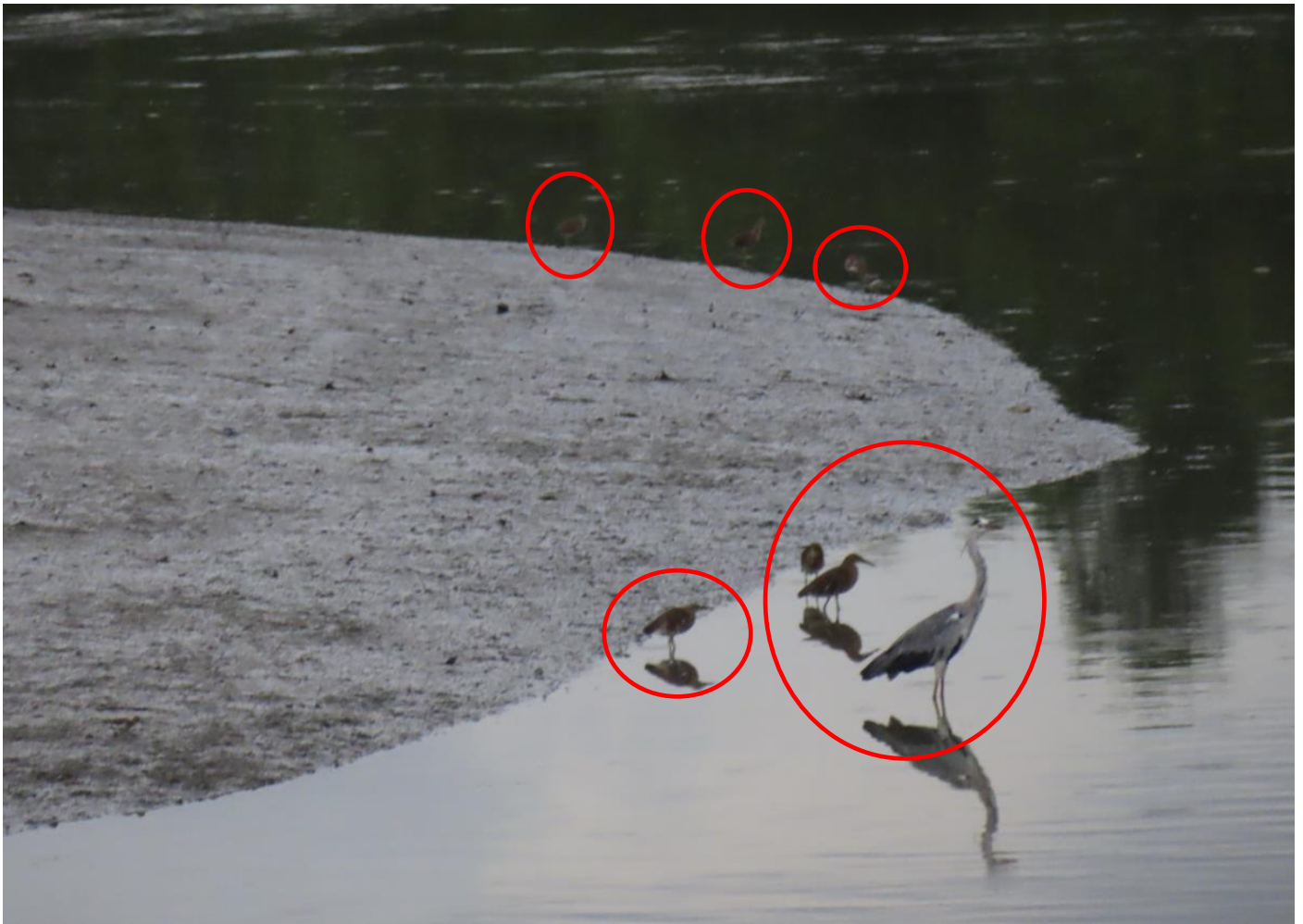
Appendix O.2.2a: Active night roost in the mudflat northeast side of the Project boundary (ANR2) observed on 25 August 2025 at around 18:46.