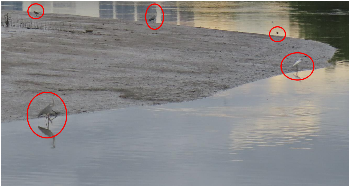
Appendix O.2.1a: Pre-roost aggregate of ardeids in the mudflat northeast side of the Project boundary (ANR2) observed on 25 August 2025 at around 18:29.