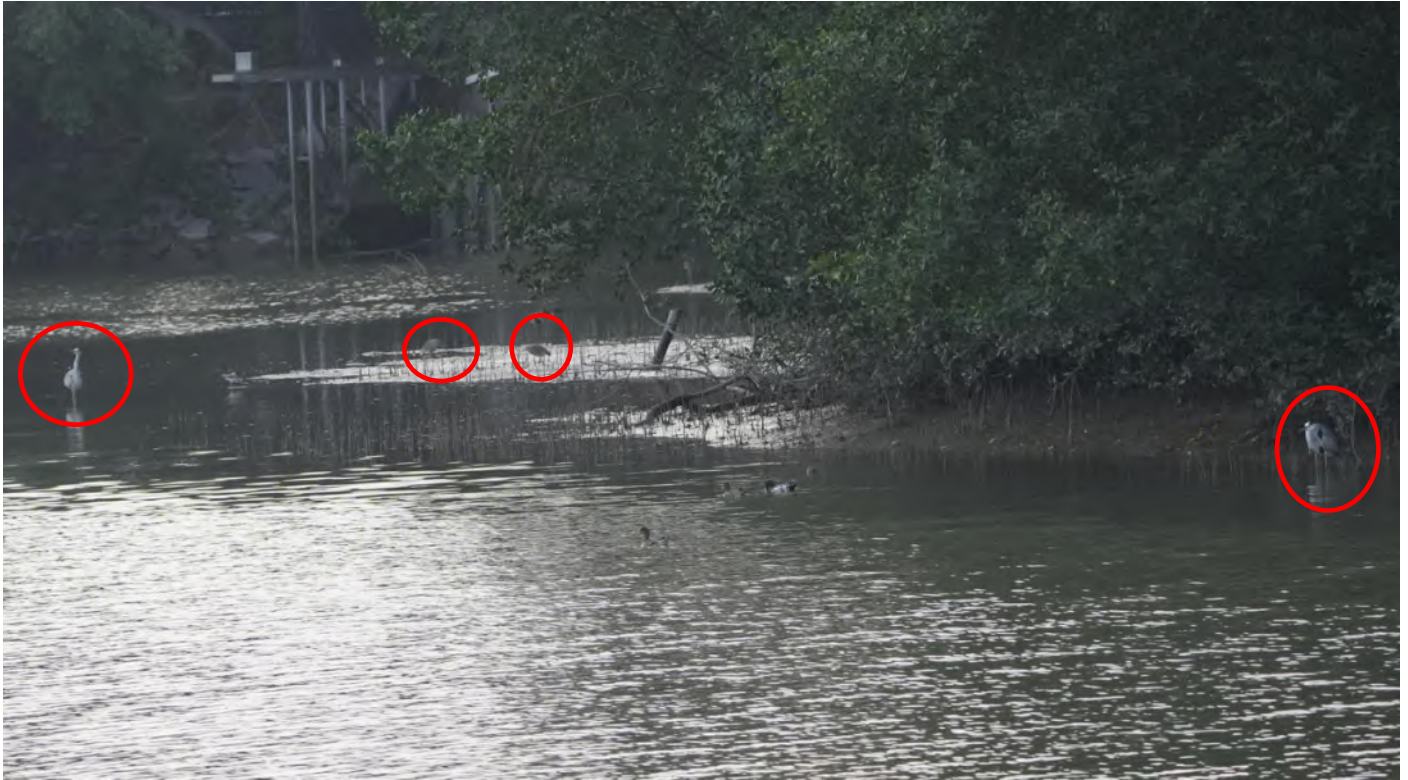
Appendix O.2.1a: Pre-roost aggregate of ardeids in the mudflat east side of the Project boundary (ANR1) observed on 22 December 2025 at around 17:17.