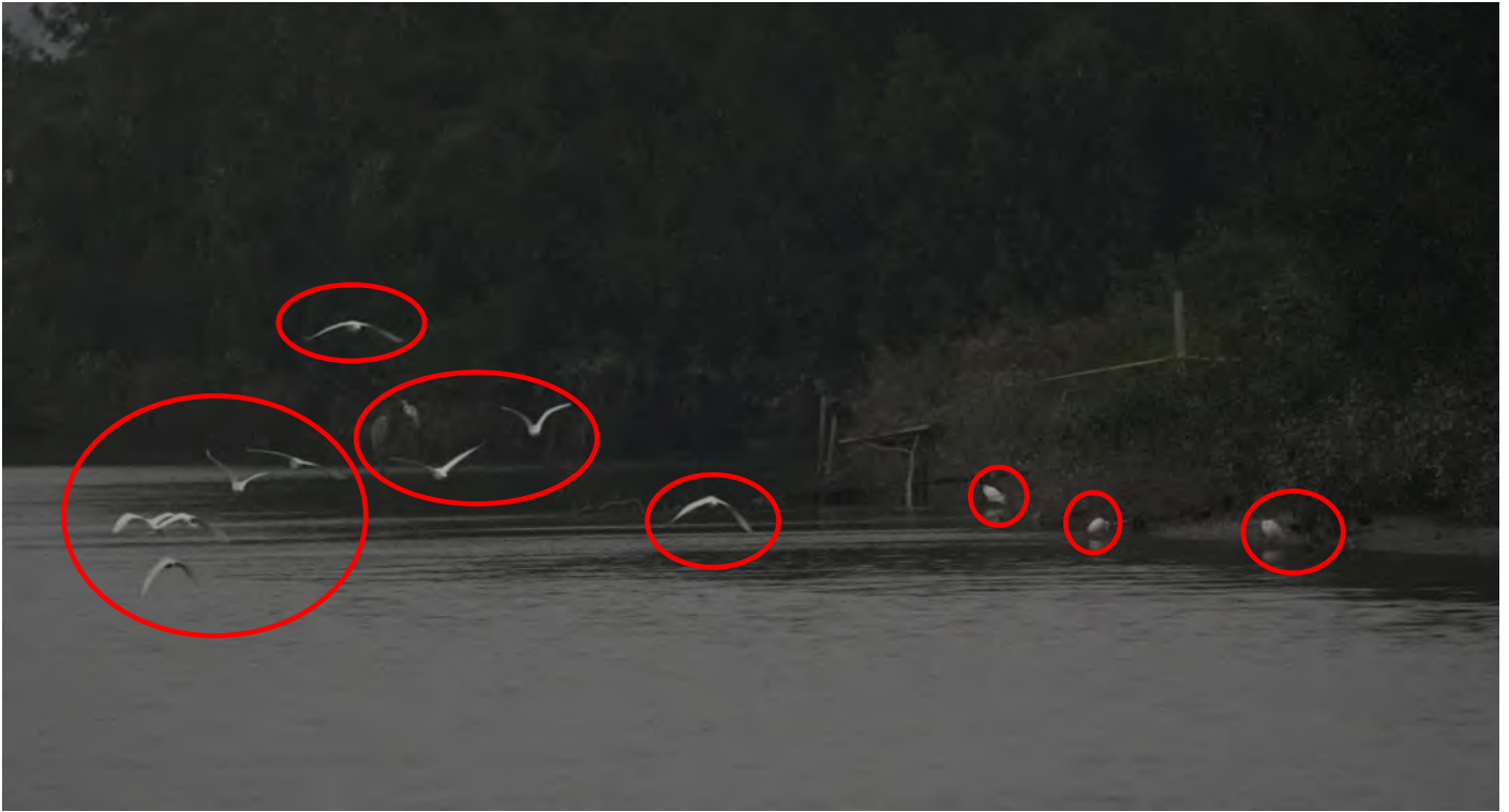
Appendix O.2.2a: Active night roost in the mudflat northeast side of the Project boundary (ANR2) observed on 22 December 2025 at around 17:36.