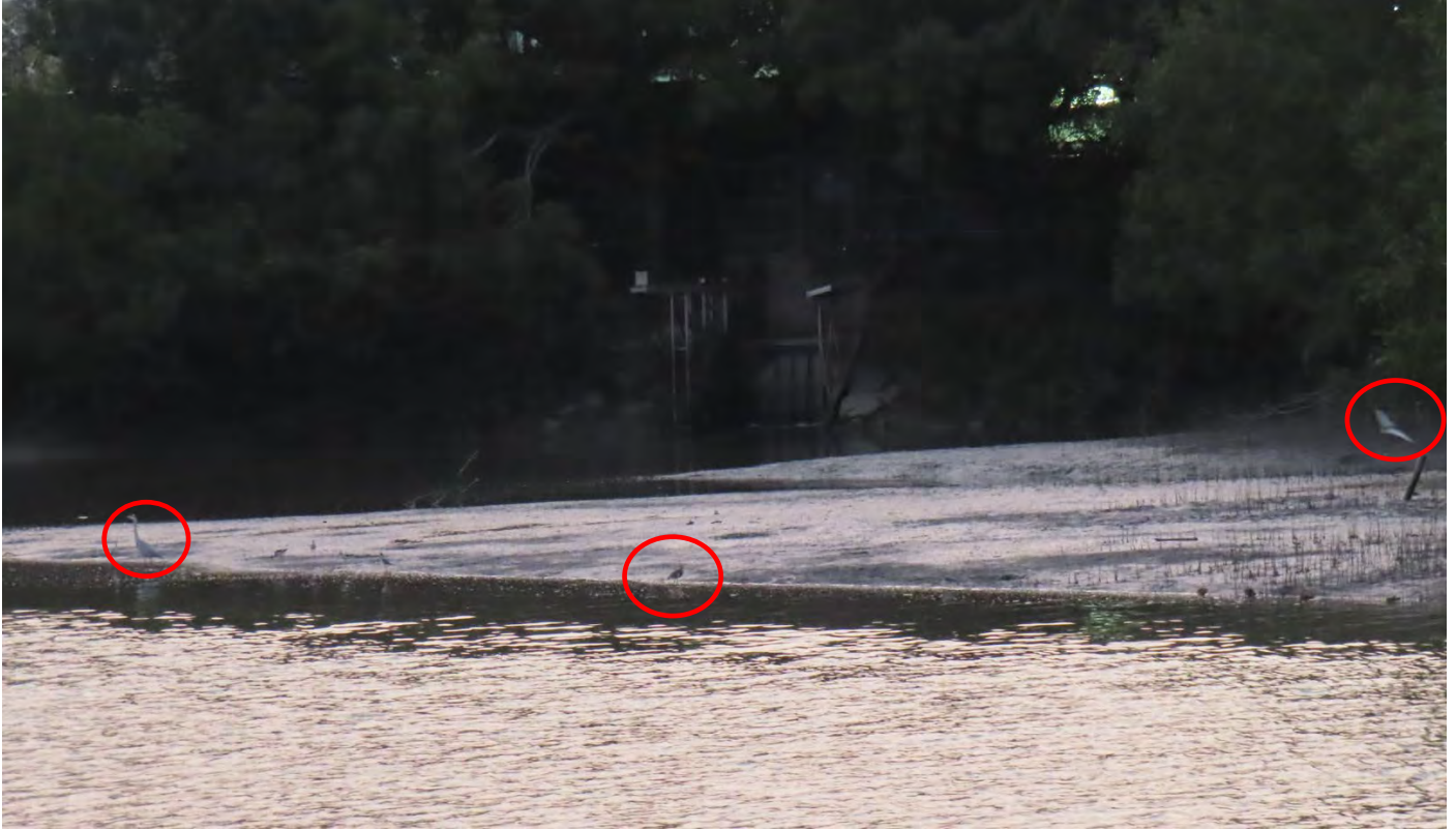
Appendix O.2.2a: Active night roost in the mudflat east side of the Project boundary (ANR1) observed on 18 March 2026 at around 18:49.