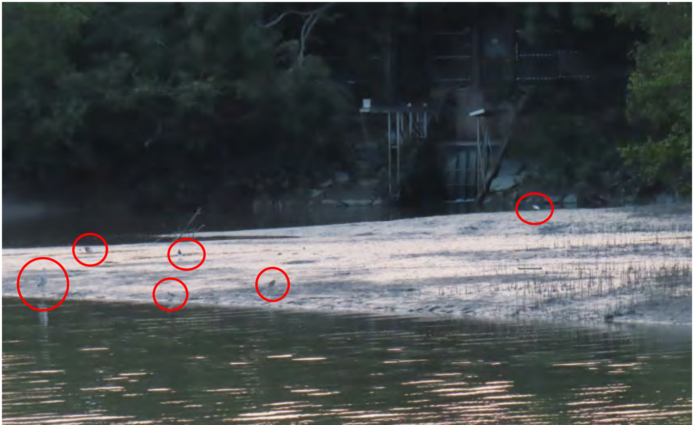
Appendix O.2.1a: Pre-roost aggregate of ardeids in the mudflat east side of the Project boundary (ANR1) observed on 18 March 2026 at around 18:21.