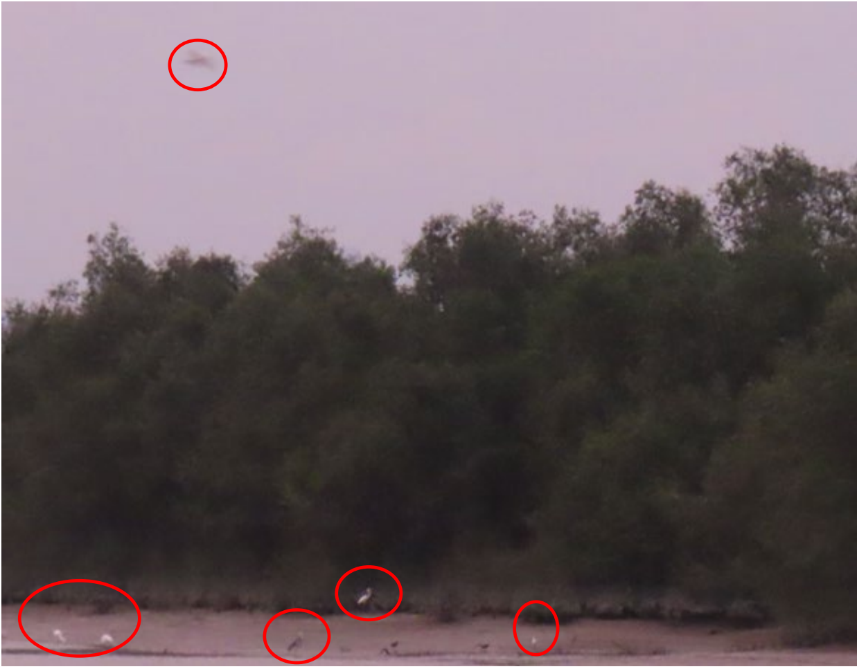
Appendix O.2.2a: Active night roost in the mudflat northeast side of the Project boundary (ANR2) observed on 22 April 2026 at around 18:58.