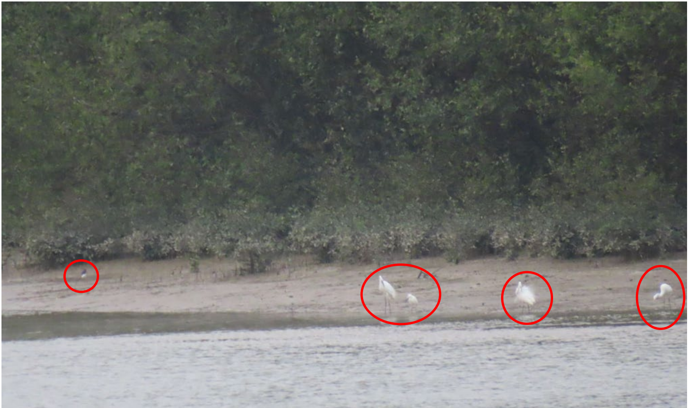
Appendix O.2.1a: Pre-roost aggregate of ardeids in the mudflat northeast side of the Project boundary (ANR2) observed on 22 April 2026 at around 18:32.