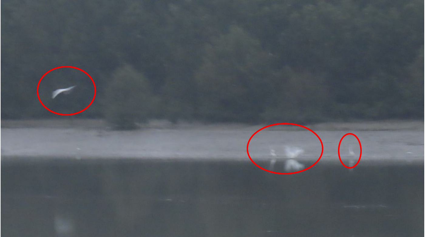
Appendix O.2.2a: Active night roost in the mudflat northeast side of the Project boundary (ANR2) observed on 5 May 2026 at around 18:54.