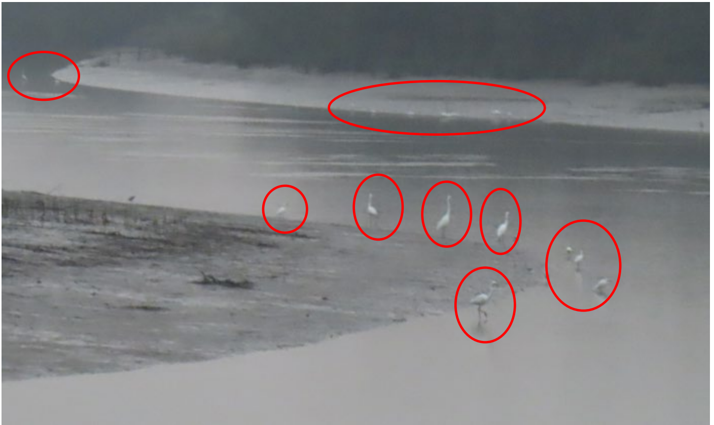
Appendix O.2.1a: Pre-roost aggregate of ardeids in the mudflat northeast side of the Project boundary (ANR2) observed on 5 May 2026 at around 18:37.