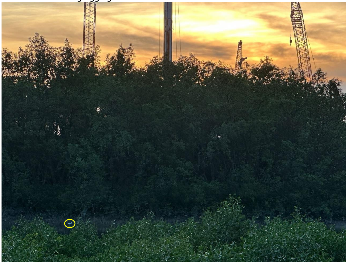
Appendix O.2.1: Pre-roost aggregate of Little Egret Egretta garzetta northeast of the Project boundary observed on 25 July 2023 around 18:45.