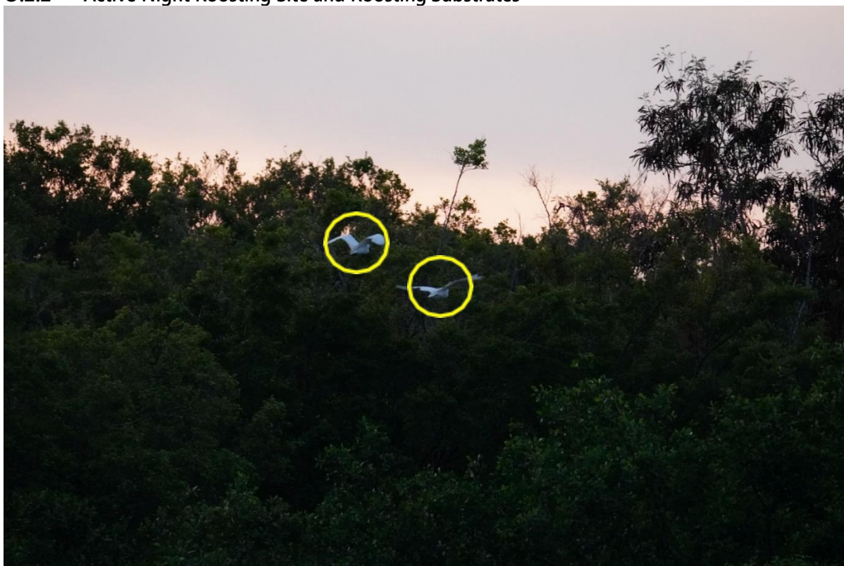
Appendix O.2.2: Active night roost on Sonneratia apetala mangrove roosting substrate located northeast of the Project boundary observed on 25 July 2023 around 19:08.