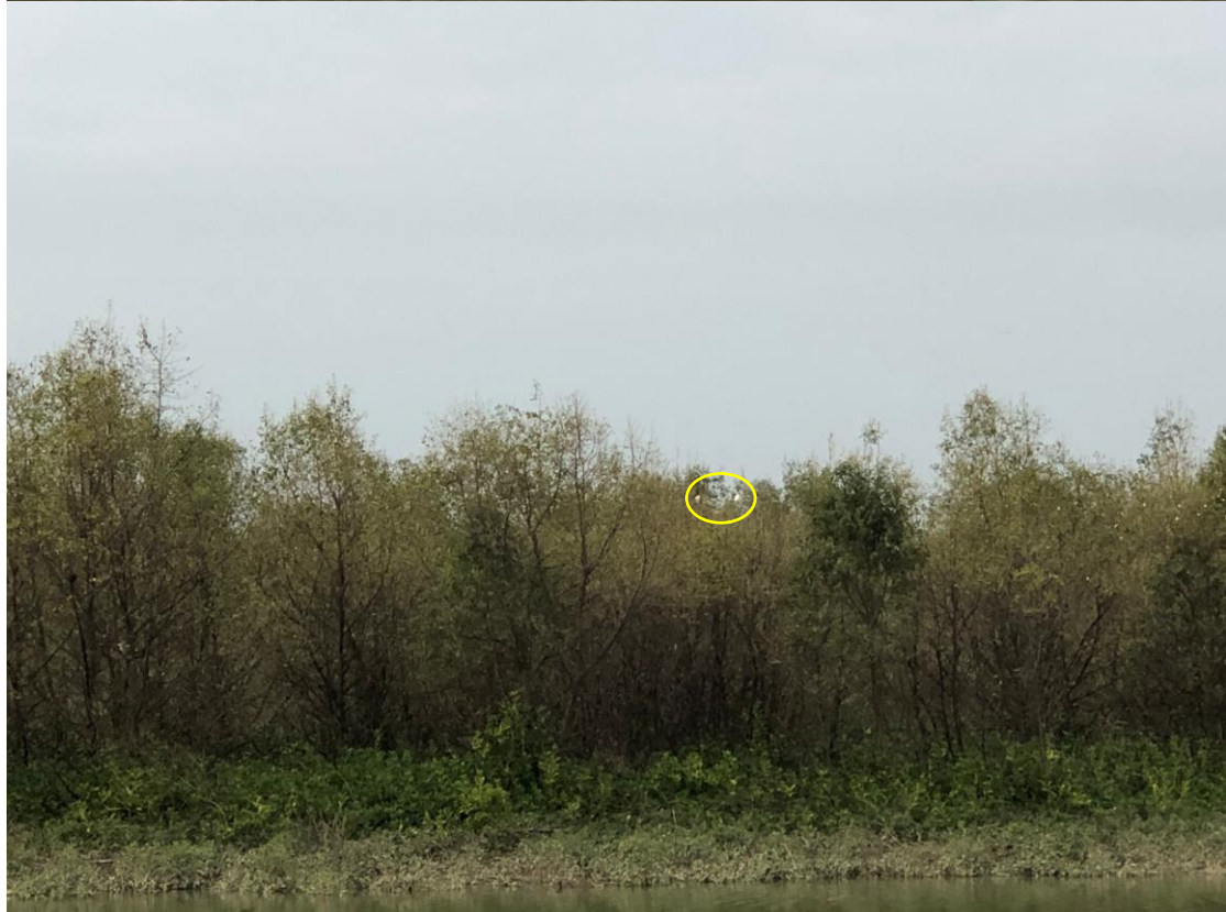
Appendix O.2.1b: Active night roost on Sonneratia apetala and S. caseolaris mangrove roosting substrate located northeast of the Project boundary observed on 17 January 2023 around 17:50