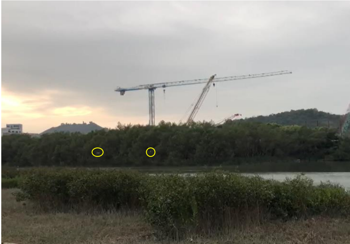
Appendix O.2.1a: Active night roost on Sonneratia apetala and S. caseolaris mangrove roosting substrate located east of the Project boundary observed on 17 January 2023 around 17:50