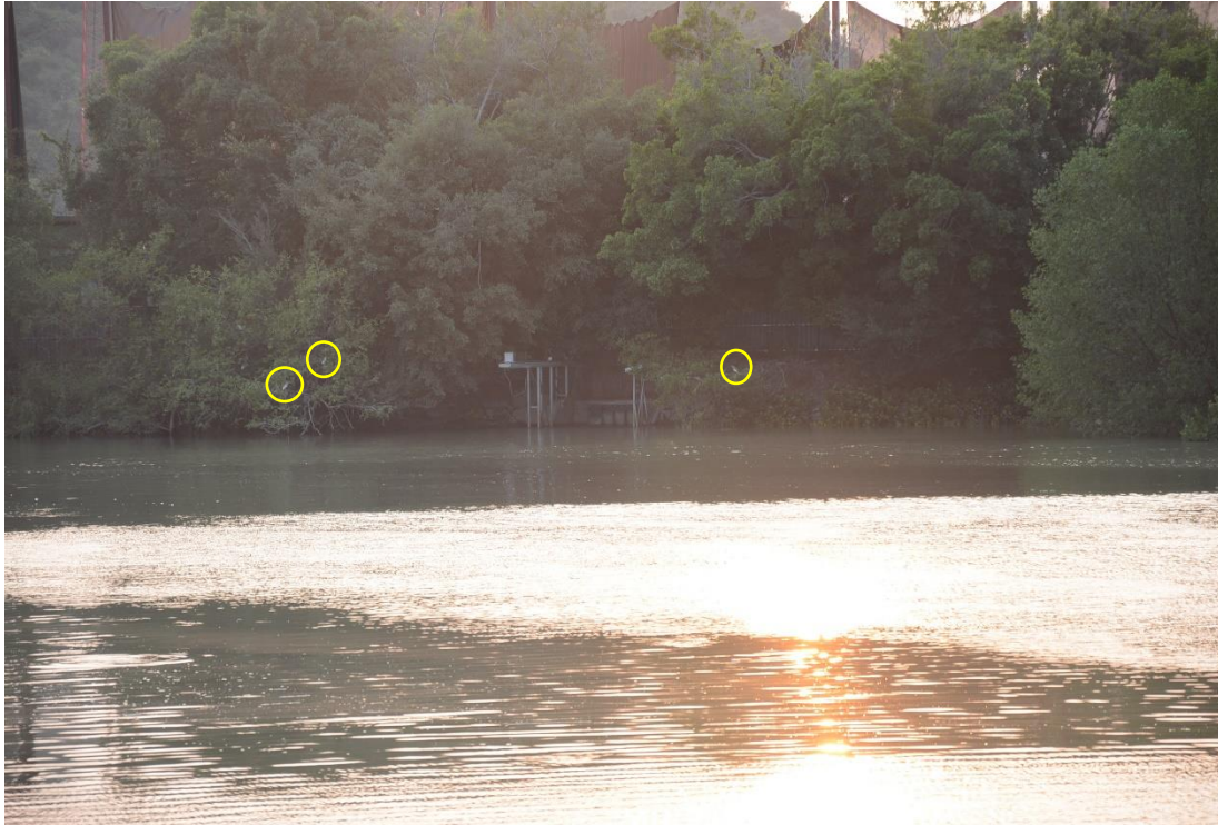
Appendix O.2.1a: Pre-roost aggregate of Chinese Pond Heron Ardeola bacchus northeast of the Project boundary observed on 17 March 2023 around 17:58.