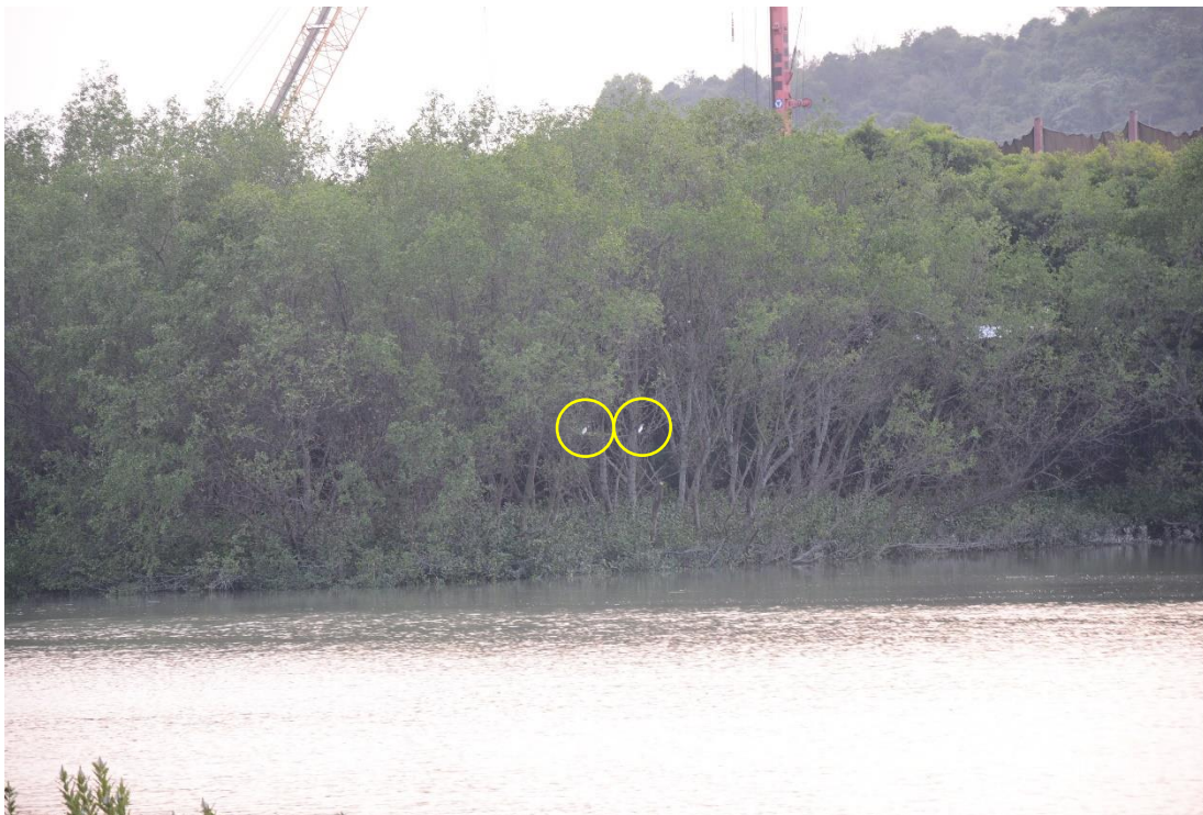
Appendix O.2.1b: Pre-roost aggregate of Chinese Pond Heron Ardeola bacchus northeast of the Project boundary observed on 17 March 2023 around 17:59.