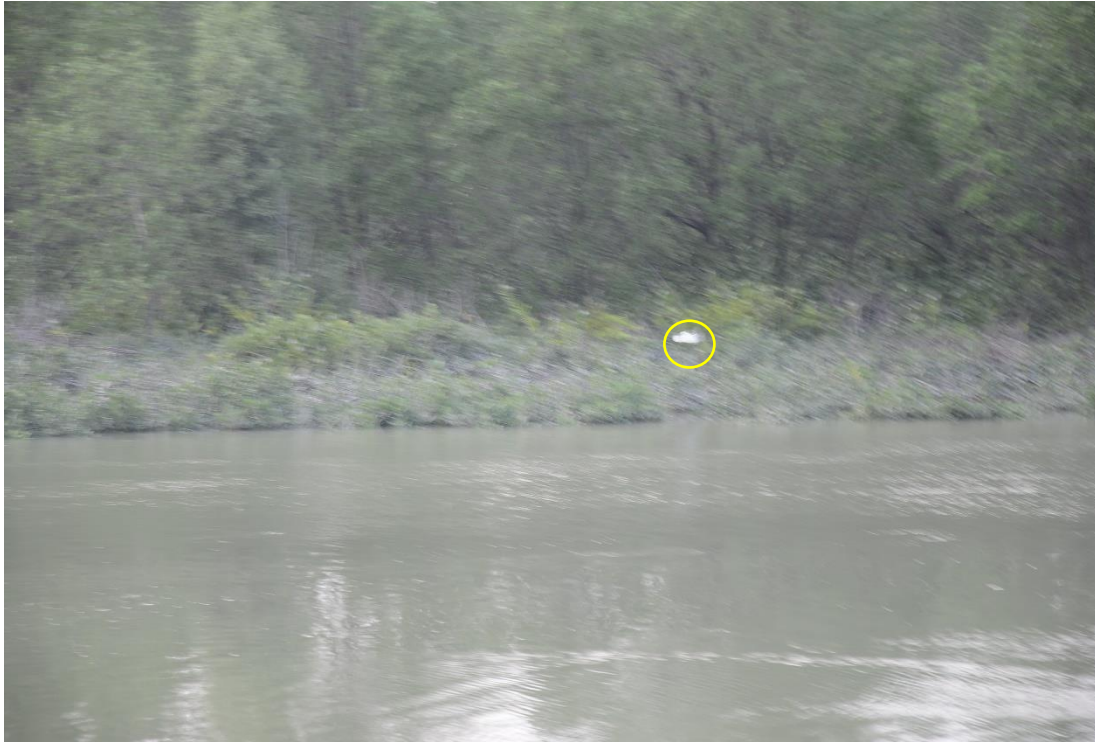
Appendix O.2.2a: Active night roost on Sonneratia apetala and S. caseolaris mangrove roosting substrate located northeast of the Project boundary observed on 17 March 2023 around 18:24.