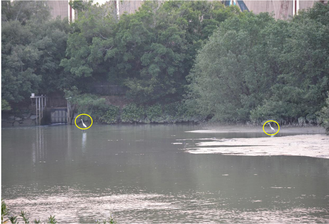
Appendix O.2.1a: Pre-roost aggregate of Great Egret Ardea alba northeast of the Project boundary observed on 12 April 2023 around 18:00.