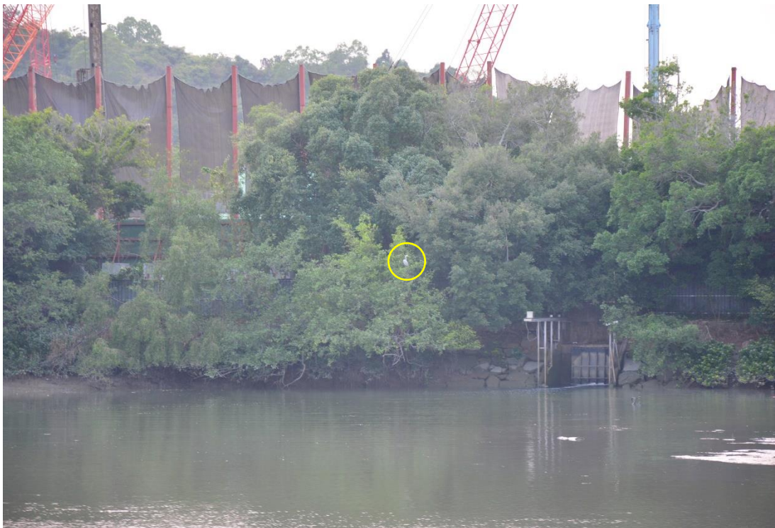
Appendix O.2.1b: Pre-roost aggregate of Grey Heron Ardea cinerea northeast of the Project boundary observed on 12 April 2023 around 18:00.