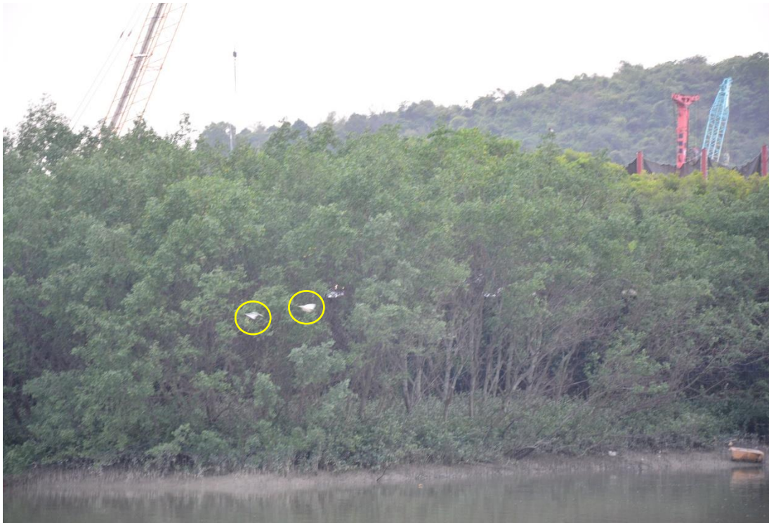
Appendix O.2.2a: Active night roost on Sonneratia apetala and S. caseolaris mangrove roosting substrate located northeast of the Project boundary observed on 12 April 2023 around 18:27.