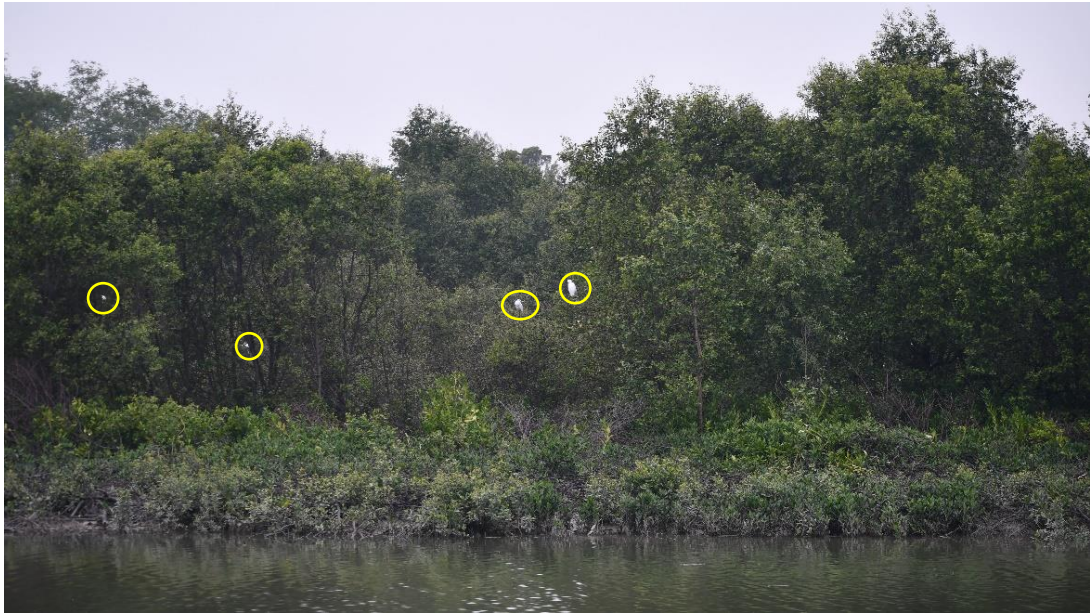
Appendix O.2.2: Active night roost on Sonneratia apetala and S. caseolaris mangrove roosting substrate located northeast of the Project boundary observed on 15 December 2022 around 17:36