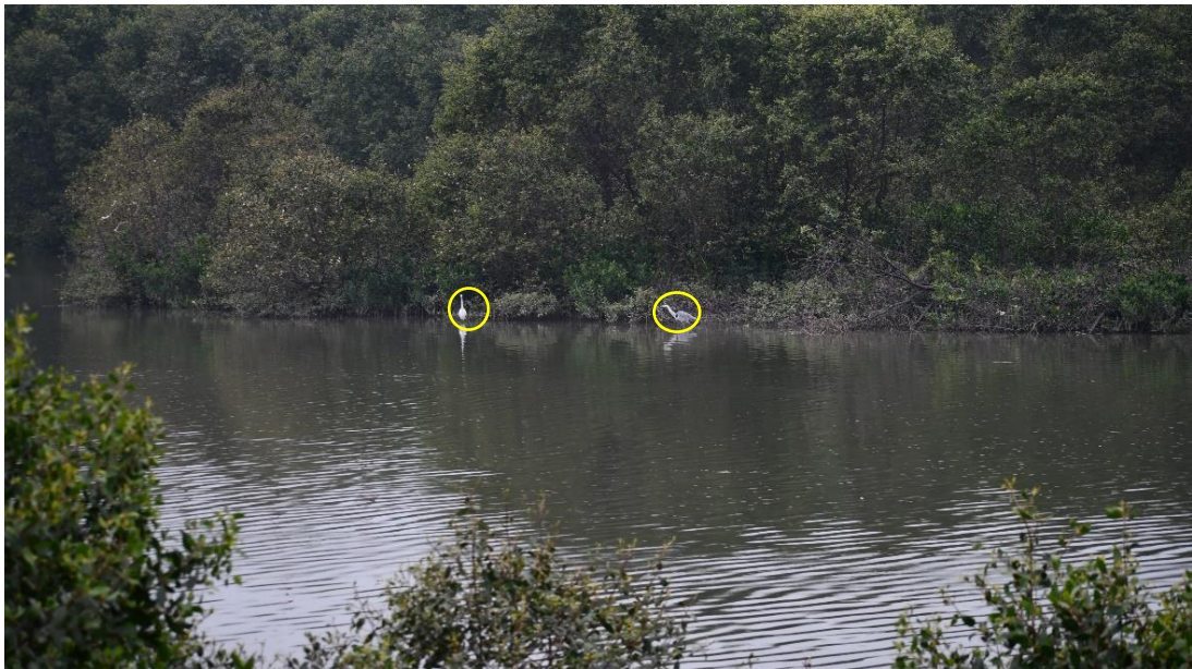
Appendix O.2.1b: Pre-roost aggregate of Great Egret Ardea alba and Grey Heron Ardea cinerea northeast of the Project boundary observed on 15 December 2022 around 17:20