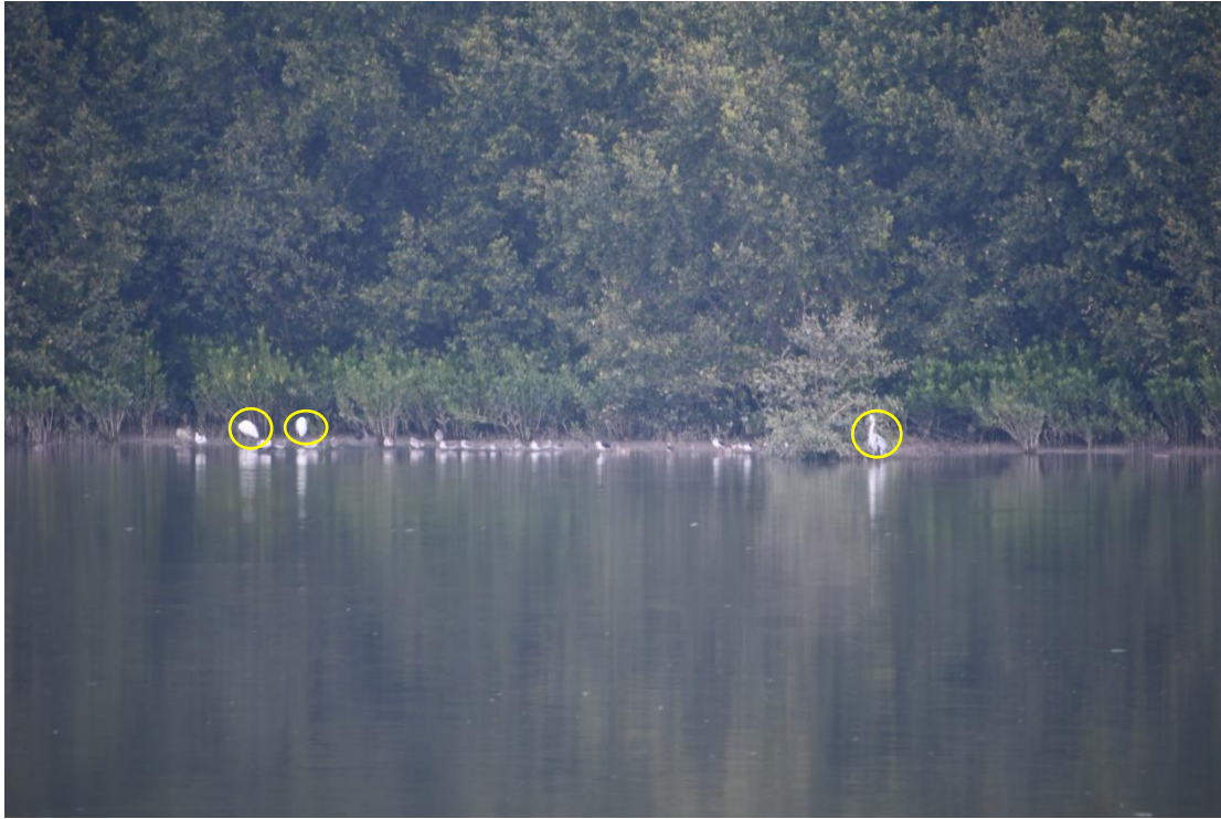
Appendix O.2.1a: Pre-roost aggregate of Great Egret Ardea alba and Grey Heron Ardea cinerea east of the Project boundary observed on 15 December 2022 around 17:20