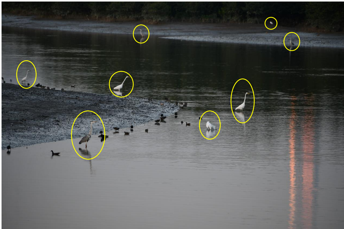
Appendix O.2.1c: Pre-roost aggregate of Great Egret Ardea alba , Little Egret Egretta garzetta and Grey Heron Ardea cinerea in the mudflat area northeast of the Project boundary observed on 11 November 2022 around 17:20