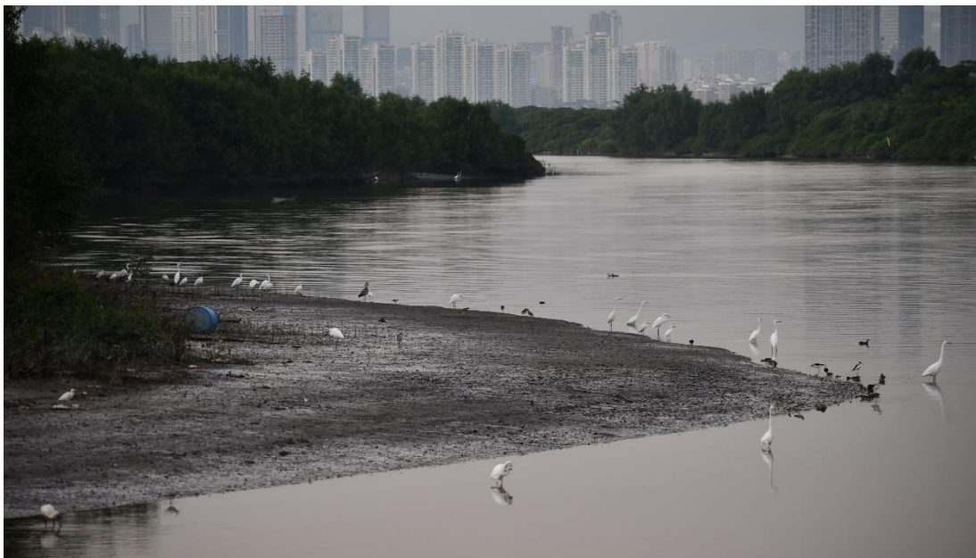
Appendix O.2.1b: Pre-roost aggregate of Great Egret Ardea alba , Little Egret Egretta garzetta and Grey Heron Ardea cinerea in the mudflat area northeast of the Project boundary observed on 11 November 2022 around 17:20