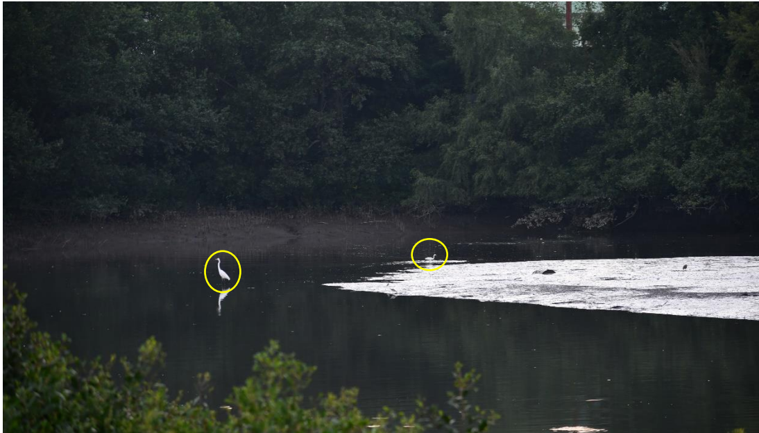
Appendix O.2.1a: Pre-roost aggregate of Little Egret Egretta garzetta and Great Egret Ardea alba in the mudflat area east of the Project boundary observed on 11 November 2022 around 17:20