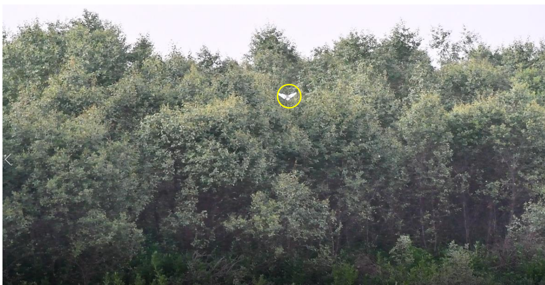
Appendix O.2.2: Active night roost on Sonneratia apetala and S. caseolaris mangrove roosting substrate located northeast of the Project boundary observed on 11 November 2022 around 17:40