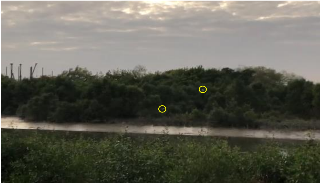
Appendix O.2.2: Active night roost on Sonneratia apetala and S. caseolaris mangrove roosting substrate located northeast of the Project boundary observed on 13 October 2022 around 18:20