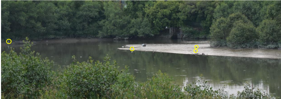
Appendix O.2.1a: Pre-roost aggregate of Chinese Pond Heron Ardeola bacchus , Little Egret Egretta garzetta and Grey Heron Ardea cinerea in the mudflat area east of the Project boundary observed on 13 October 2022 around 17:40