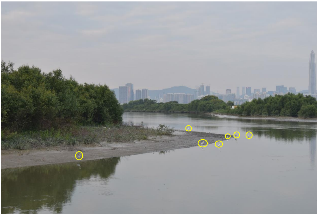
Appendix O.2.1b: Pre-roost aggregate of Great Egret Ardea alba , Little Egret Egretta garzetta and Grey Heron Ardea cinerea in the mudflat area northeast of the Project boundary observed on 13 October 2022 around 17:40