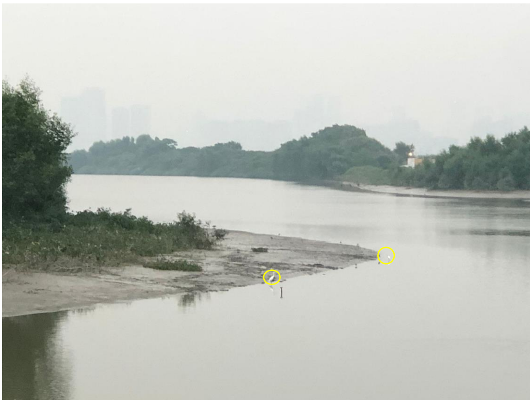
Appendix O.2.1b: Pre-roost aggregate of Little Egret Egretta garzetta in the mudflat area northeast of the Project boundary observed on 16 September 2022 around 18:10