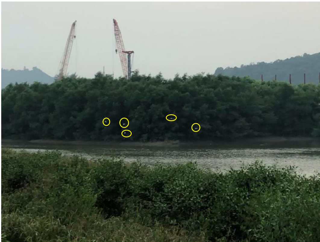
Appendix O.2.2a: Active night roost on Sonneratia apetala and S. caseolaris mangrove roosting substrate located east of the Project boundary observed on 16 September 2022 around 18:30