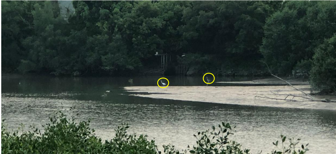
Appendix O.2.1a: Pre-roost aggregate of Little Egret Egretta garzetta and Grey Heron Ardea cinerea in the mudflat area east of the Project boundary observed on 16 September 2022 around 18:10