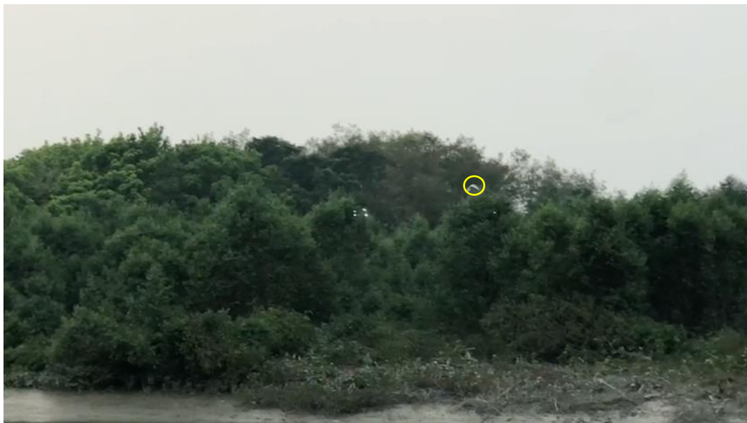
Appendix O.2.2b: Active night roost on Sonneratia apetala and S. caseolaris mangrove roosting substrate located northeast of the Project boundary observed on 16 September 2022 around 18:30