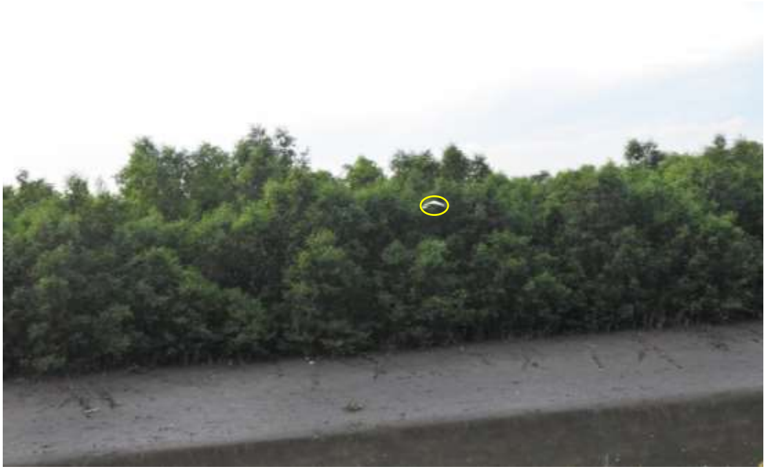
Appendix O.2.2b: One of the individuals using the active night roost with Sonneratia apetala and S. caseolaris mangrove roosting substrate located northeast of the Project boundary observed on 12 August 2022 around 19:02