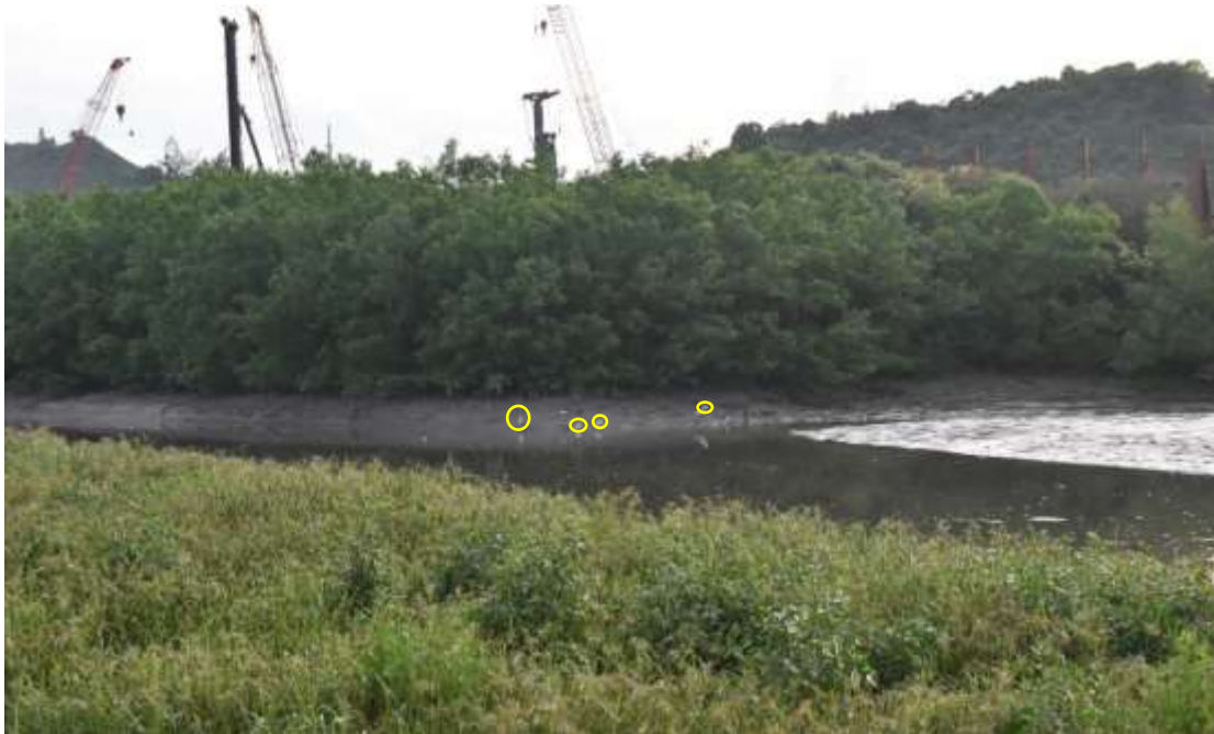
Appendix O.2.1a: Pre-roost aggregate of Chinese Pond heron Ardeola bacchus , Great Egret Ardea alba , and Little Egret Egretta garzetta in the mudflat area east of the Project boundary observed on 12 August 2022 around 18:40