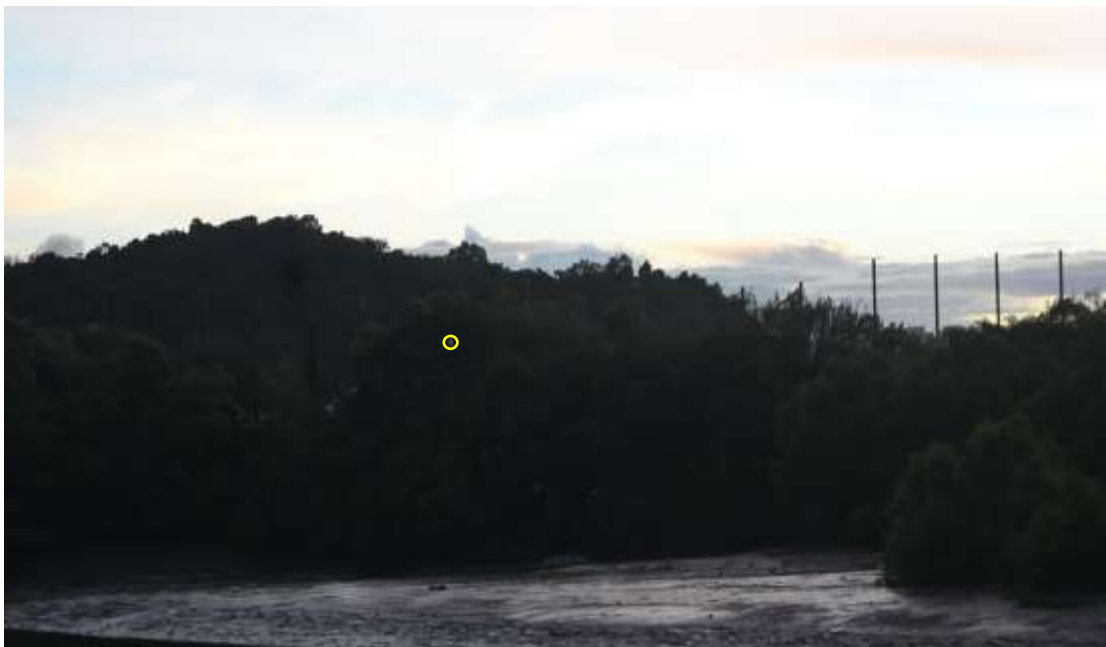
Appendix O.2.2a: Active night roost on Sonneratia apetala and S. caseolaris mangrove roosting substrate located east of the Project boundary observed on 12 August 2022 around 19:02