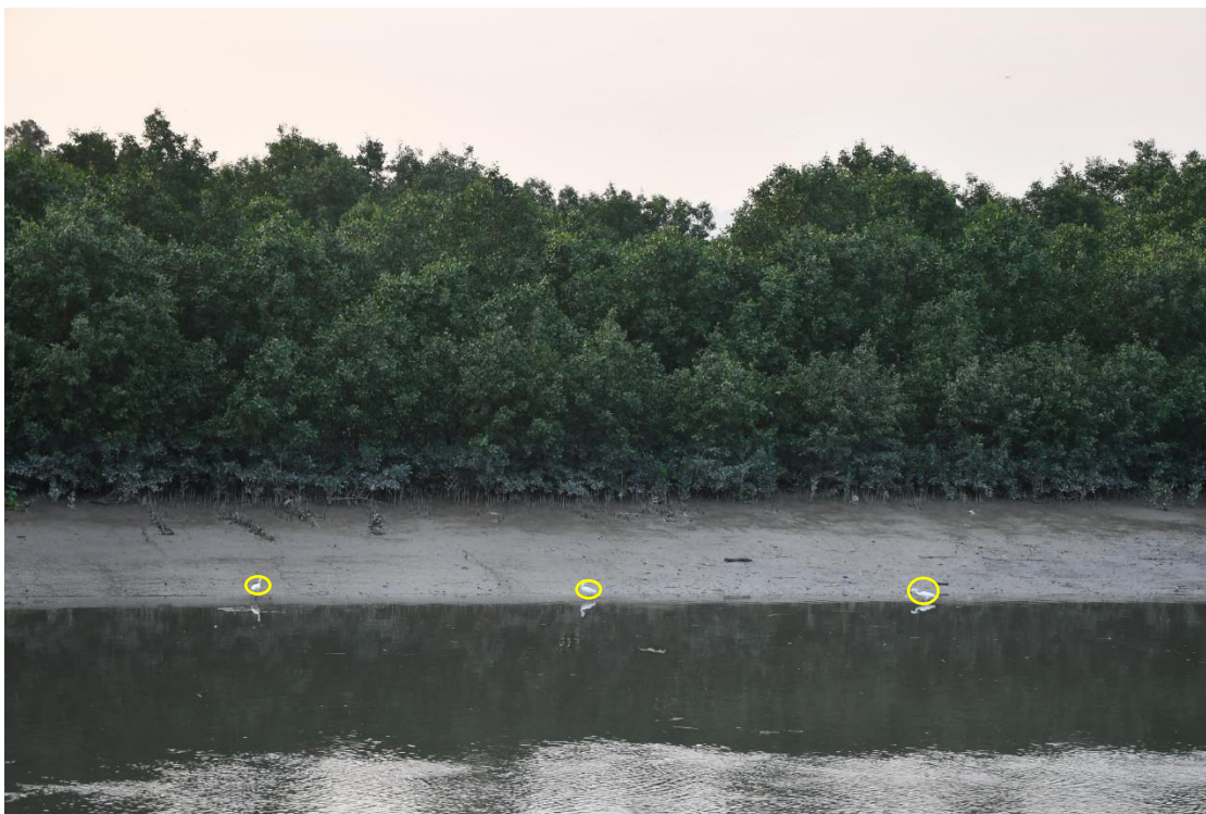
Appendix O.2.1b: Pre-roost aggregate of Little Egret Egretta garzetta in the mudflat area northeast of the Project boundary observed on 15 July 2022 around 18:15