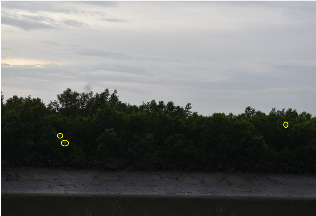
Appendix O.2.2a: Active night roost on Sonneratia apetala and S. caseolaris mangrove roosting substrate located east of the Project boundary observed on 15 July 2022 around 18:50