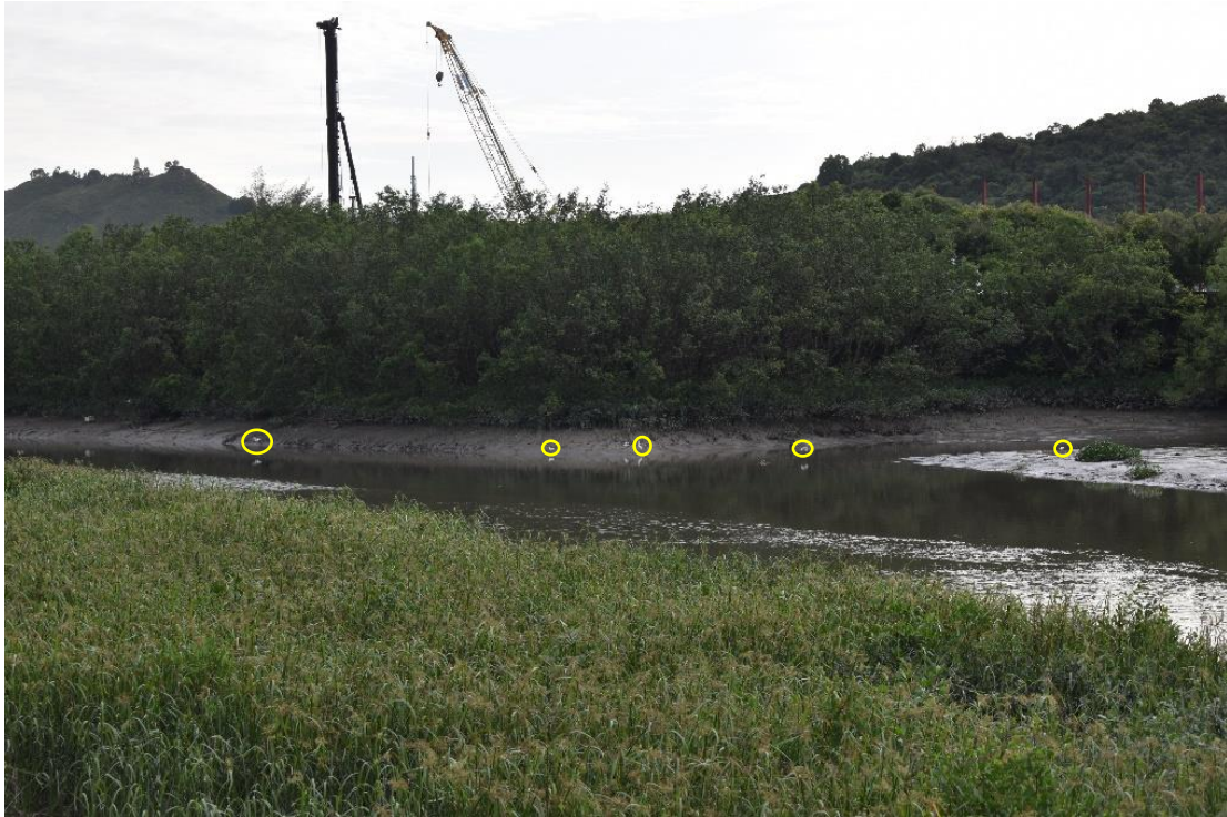
Appendix O.2.1a: Pre-roost aggregate of Chinese Pond heron Ardeola bacchus and Little Egret Egretta garzetta in the mudflat area east of the Project boundary observed on 15 July 2022 around 18:15