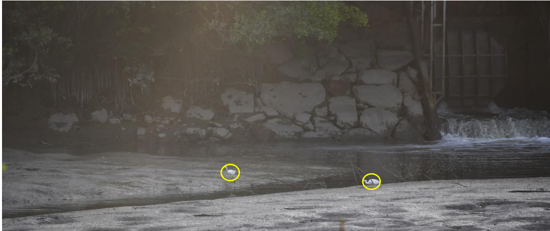
Appendix O.2.1a: Pre-roost aggregate of Little Egret Egretta garzetta in the mudflat area east of the Project boundary observed on 17 June 2022 around 19:05