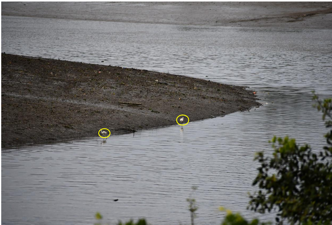
Appendix O.2.1b: Pre-roost aggregate of Little Egret Egretta garzetta in the mudflat area northeast of the Project boundary observed on 17 June 2022 around 19:05