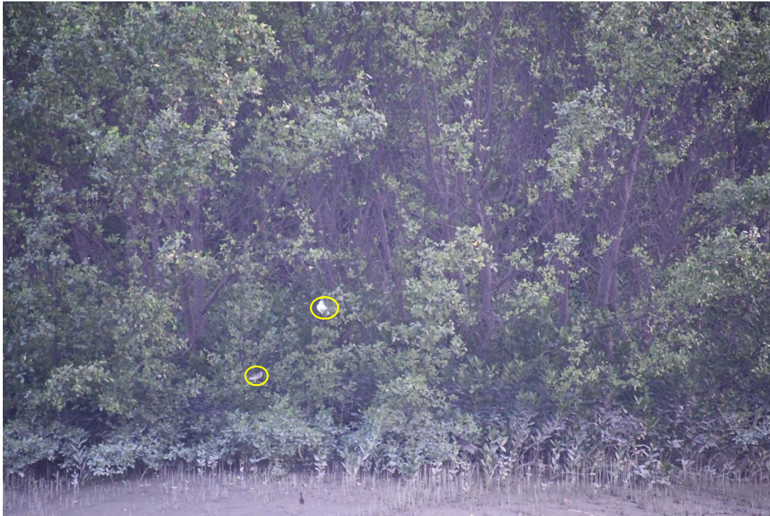
Appendix O.2.2a: Active night roost on Sonneratia apetala and S. caseolaris mangrove roosting substrate located east of the Project boundary observed on 17 June 2022 around 19:21