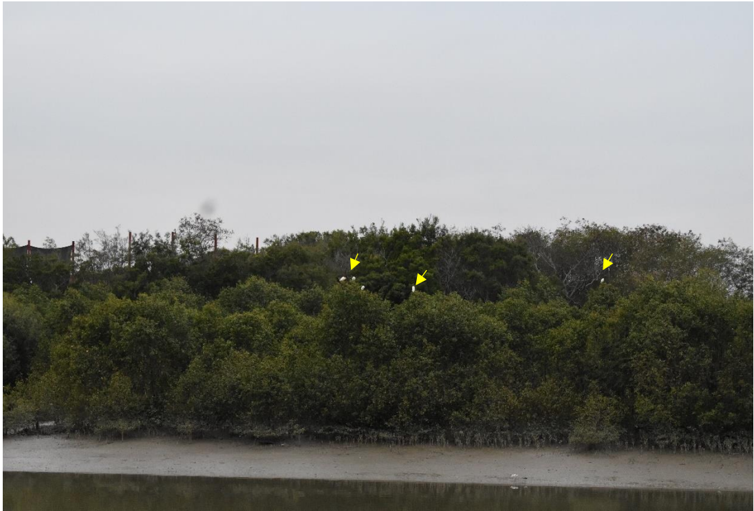
Appendix O.2.2b: Active night roost on Sonneratia apetala and S. caseolaris mangrove roosting substrate located northeast of the Project boundary observed on 18 February 2022 around 18:03