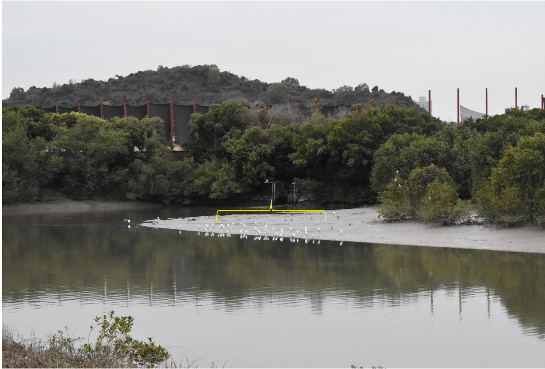
Appendix O.2.1a: Pre-roost aggregate of Eastern Cattle Egret Bubulcus coromandus in the mudflat area northeast of the Project boundary observed on 18 February 2022 around 17:50