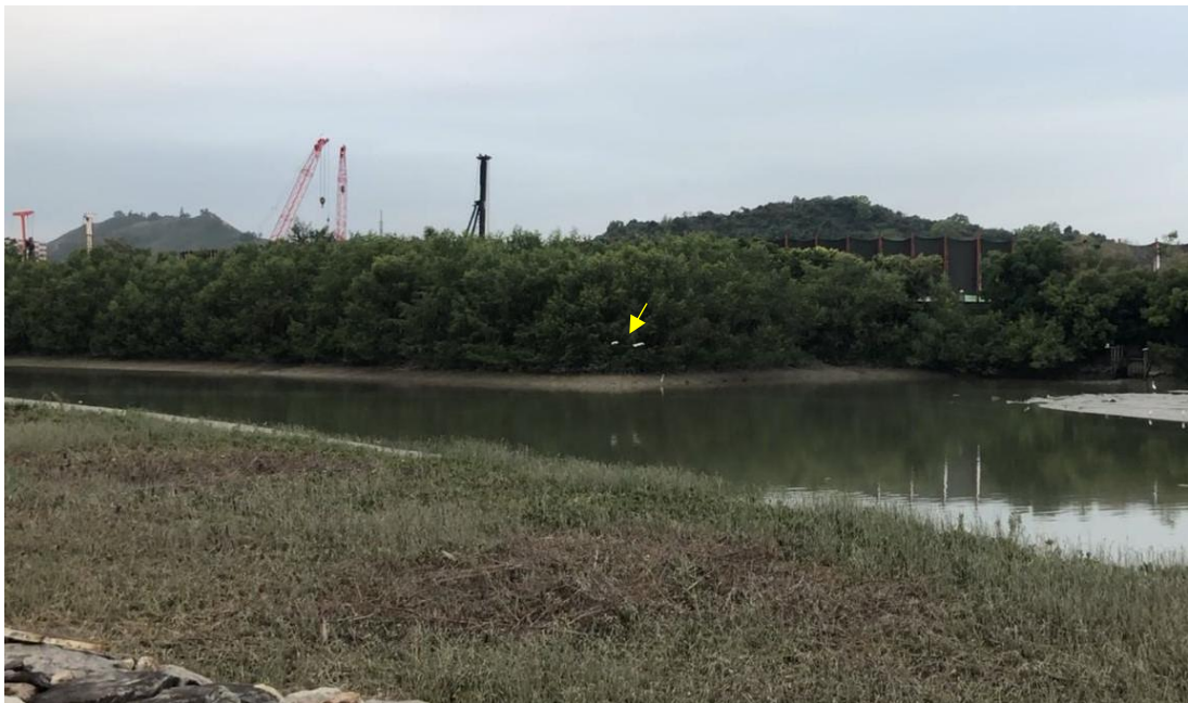
Appendix O.2.2a: Active night roost on Sonneratia apetala and S. caseolaris mangrove roosting substrate located east of the Project boundary observed on 18 February 2022 around 18:03