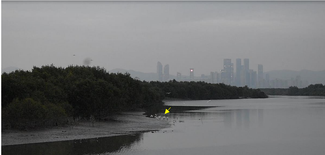
Appendix O.2.1a: Pre-roost aggregate of Little Egret Egretta garzetta in the mudflat area northeast of the Project boundary observed on 21 January 2022 around 17:30