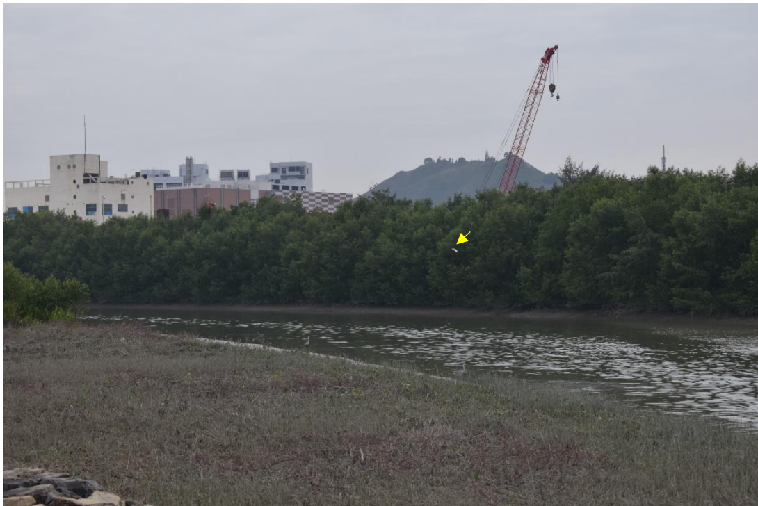
Appendix O.2.2a: Active night roost on Sonneratia apetala and S. caseolaris mangrove roosting substrate located east of the Project boundary observed on 21 January 2021 around 18:01