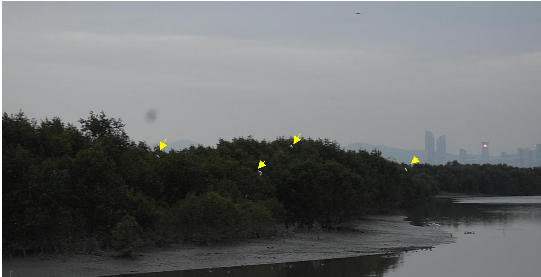
Appendix O.2.2b: Active night roost on Sonneratia apetala and S. caseolaris mangrove roosting substrate located northeast of the Project boundary observed on 21 January 2021 around 18:01