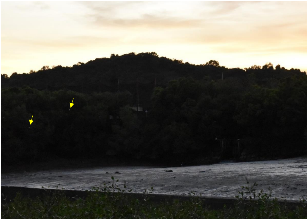
Appendix O.2.2a: Active night roost on Sonneratia apetala and S. caseolaris mangrove roosting substrate located east of the Project boundary observed on 20 September 2021 around 18:26