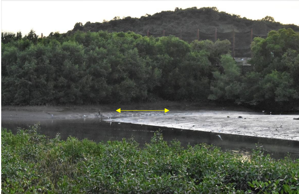
Appendix O.2.1a: Pre-roost aggregate of the Little Egret Egretta garzetta in the mudflat area east of the Project boundary observed on 20 September 2021 around 17:28