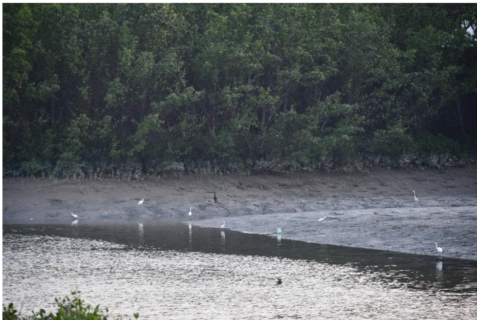
Appendix O.2.1b: Pre-roost aggregate of the Eastern Cattle Egret Bubulcus coromandus and Little Egret Egretta garzetta in the mudflat area east of the Project boundary observed on 09 July 2021 around 18:50