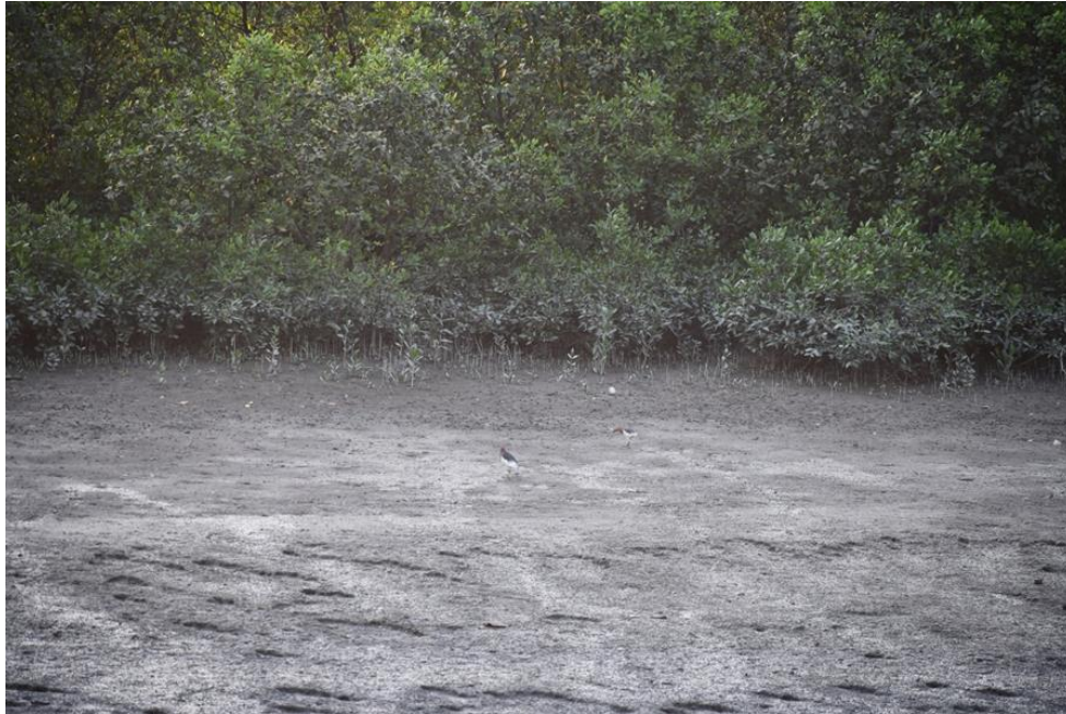
Appendix O.2.1a: Pre-roost aggregate of the Chinese Pond Heron in the mudflat area northeast of the Project boundary observed on 09 July 2021 around 18:31