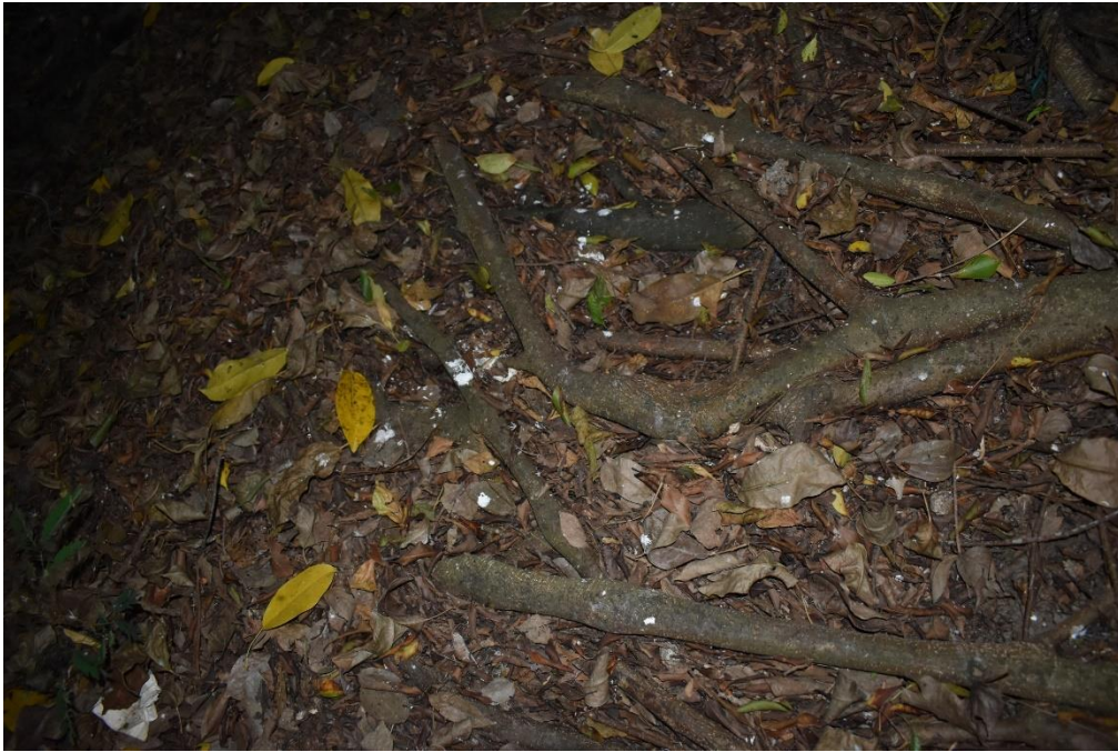
Appendix O.2.3: Bird droppings on leaf litter and roots within the vicinity of the mangrove strip east of the Project boundary observed on 18 May 2021 around 18:10