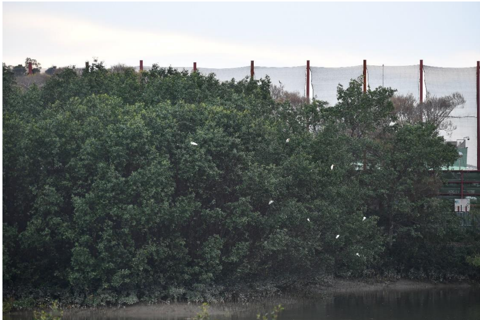
Appendix O.2.2: Active night roost on Sonneratia apetala and S. caseolaris mangrove roosting substrate located east of the Project boundary observed on 18 May 2021 around 18:10