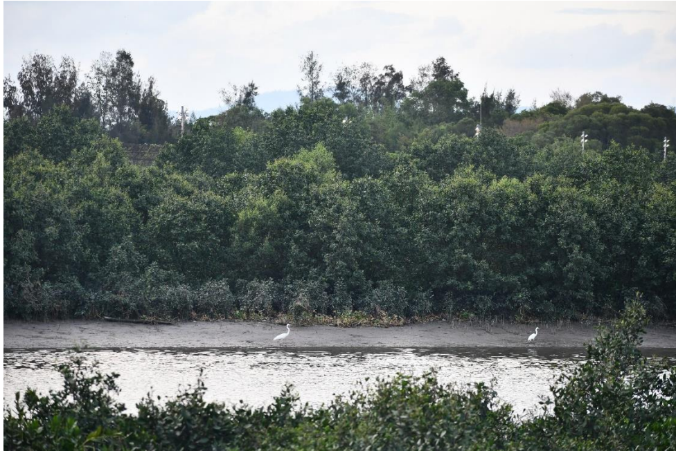
Appendix O.2.1: Pre-roost aggregate of the Great Egret